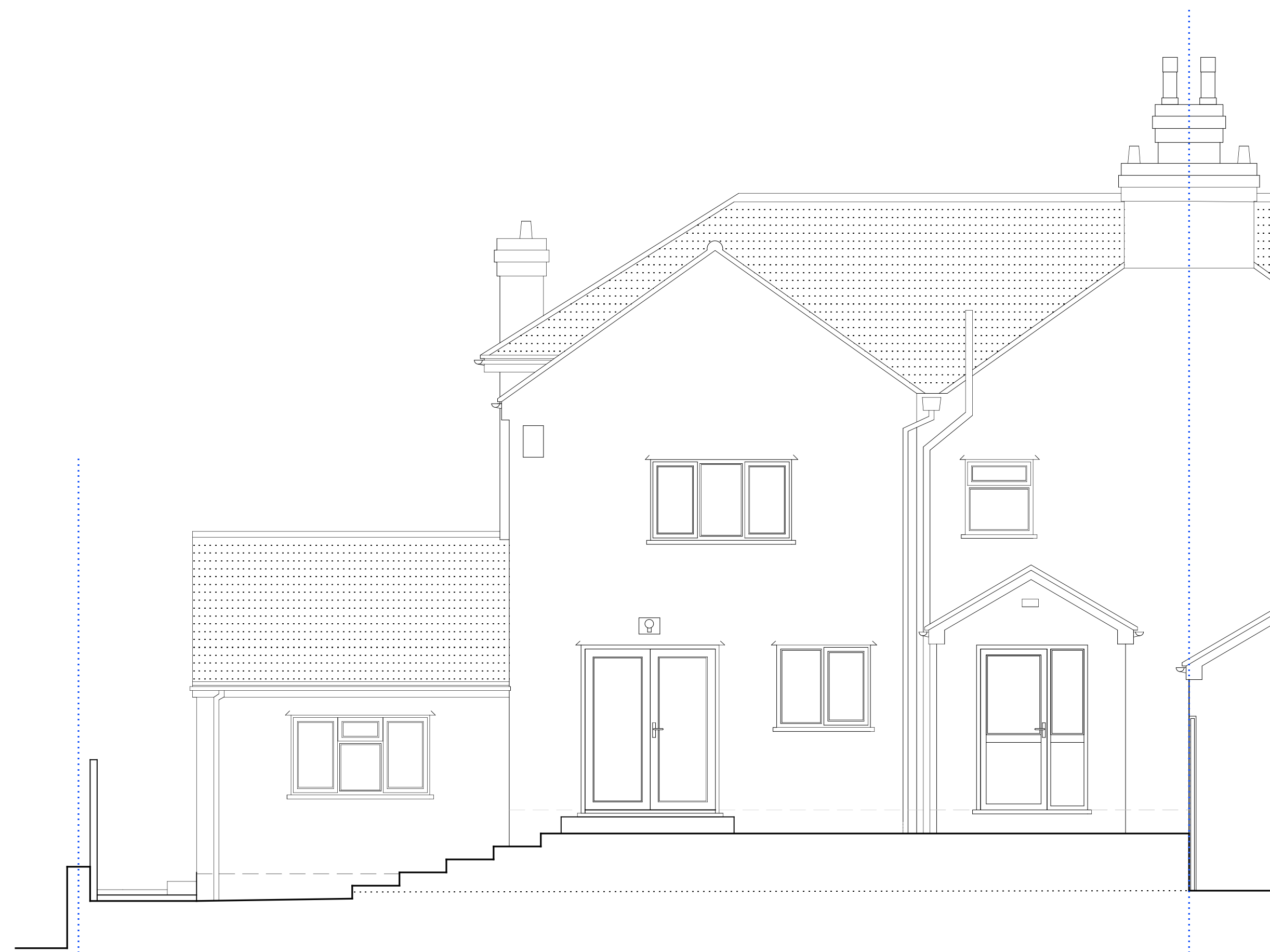
REAR ELEVATION Scale 1:50