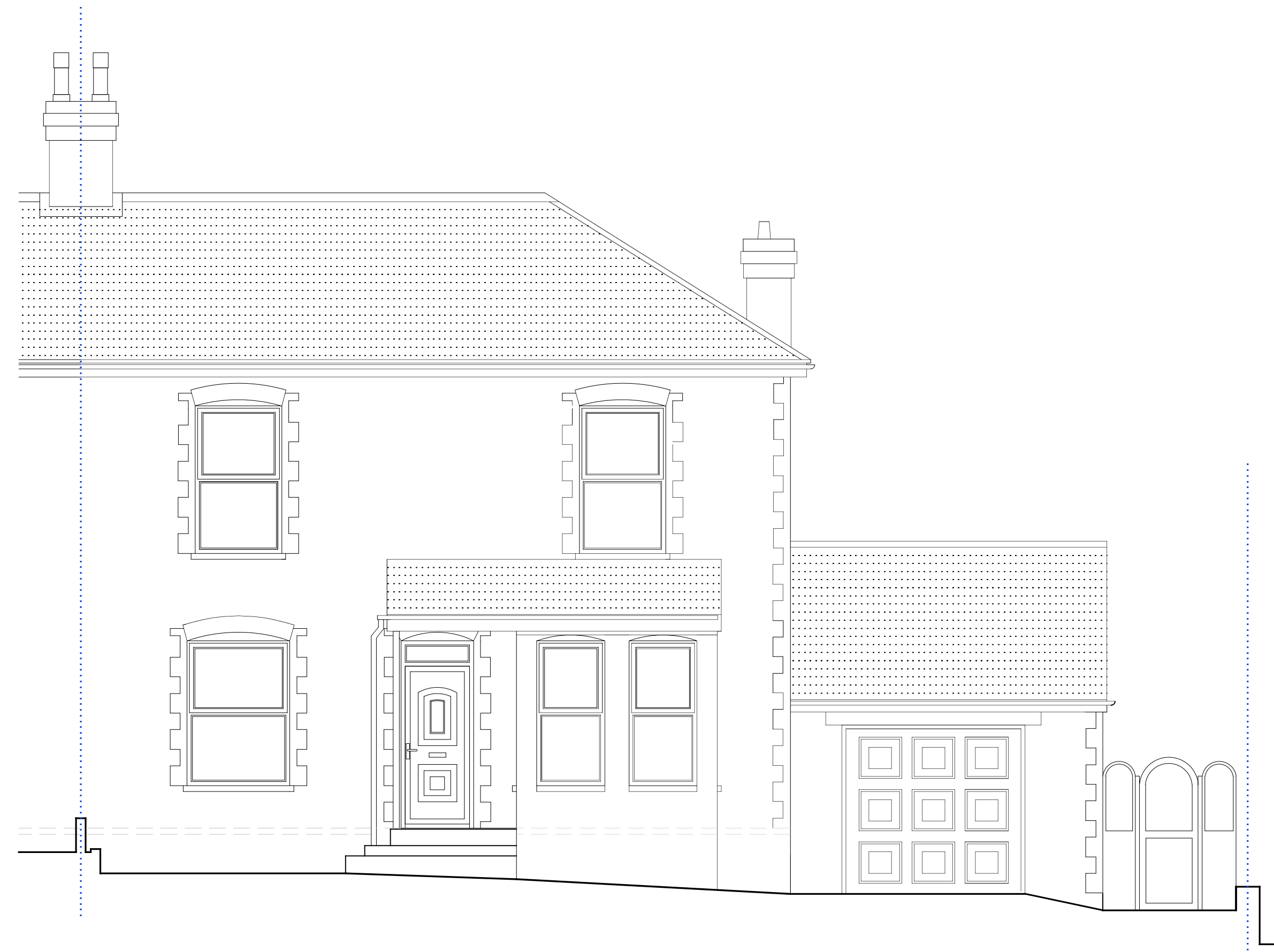
FRONT ELEVATION Scale 1:50