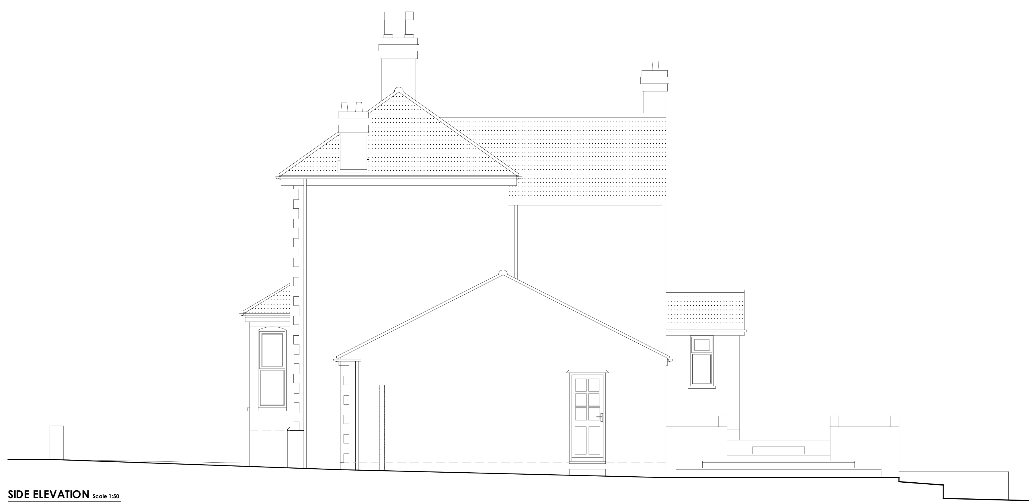
SIDE ELEVATION Scale 1:50