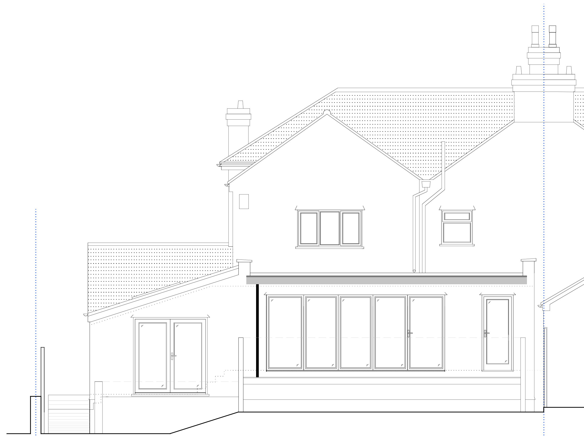
REAR ELEVATION Scale 1:50