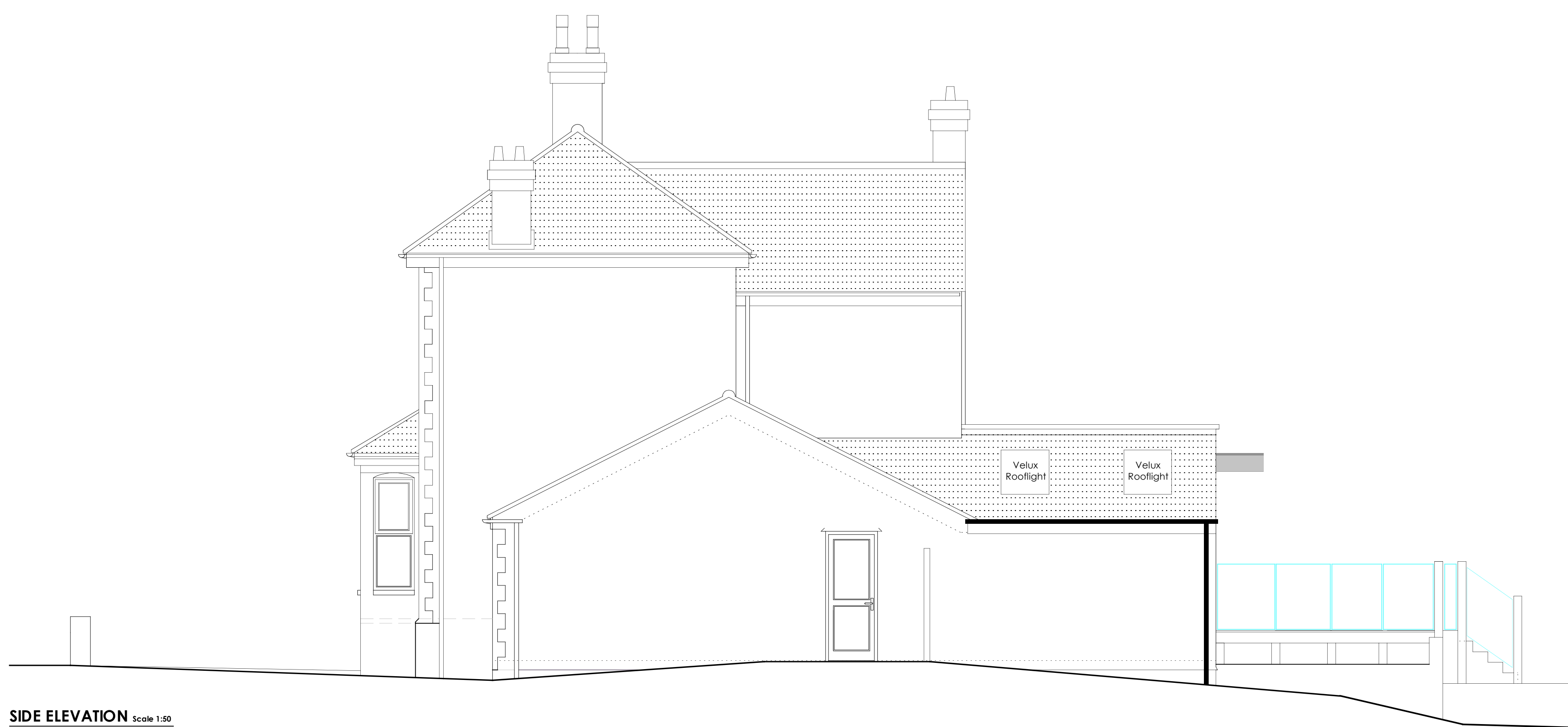
SIDE ELEVATION Scale 1:50