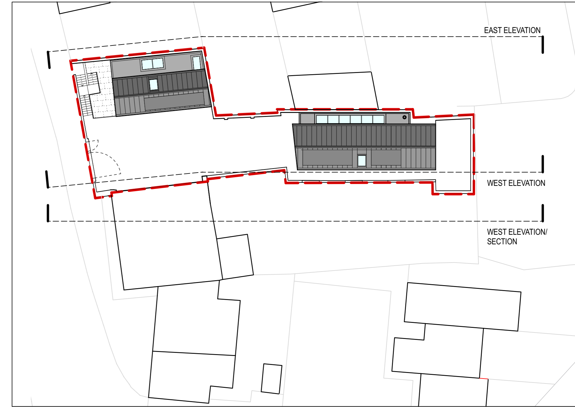
KEY PLAN 1:250

Mapping contents © Crown copyright and database rights 2023 Ordnance Survey 100035207