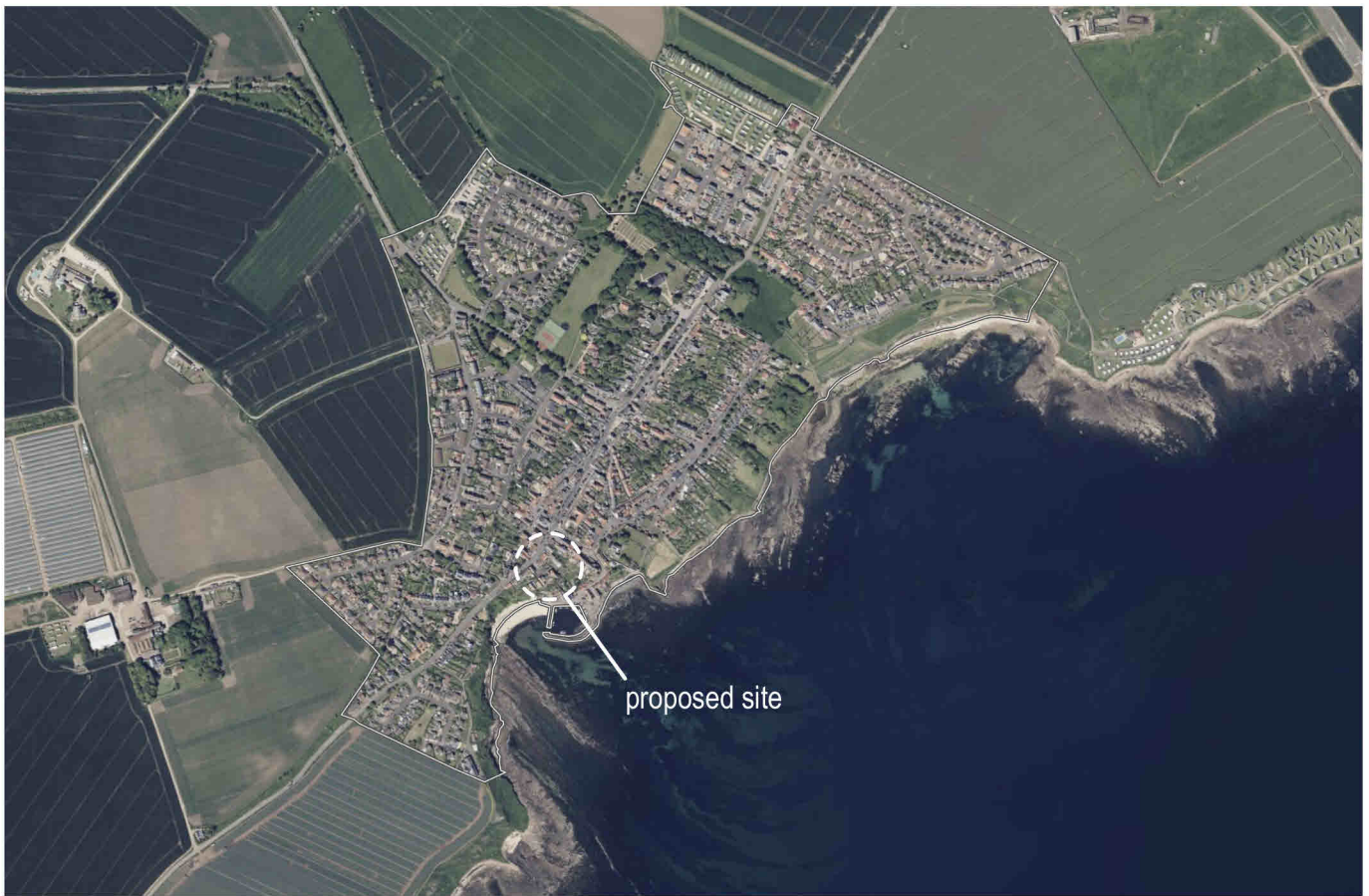
AERIAL IMAGE - Crail