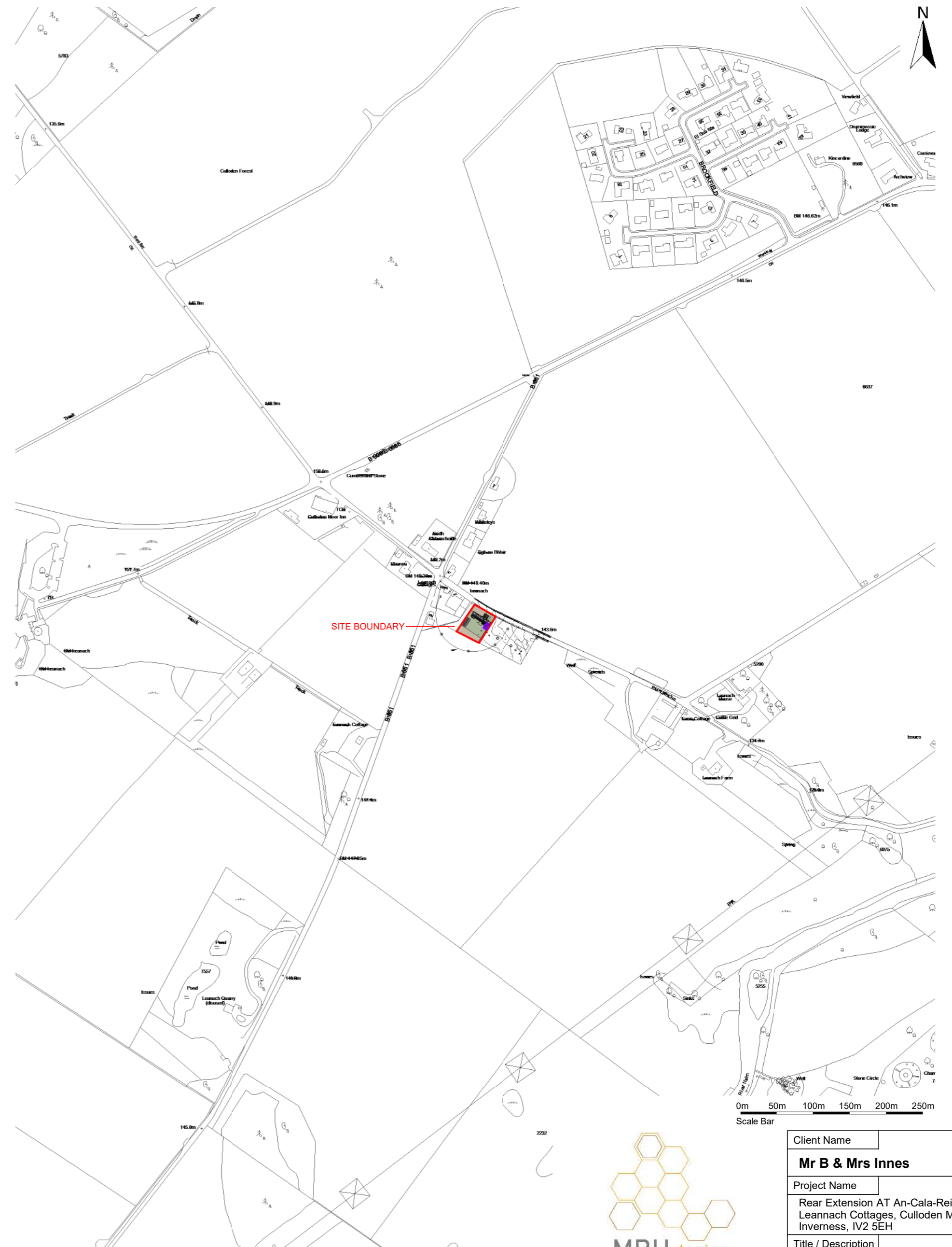
2 Location Plan 1 : 5000

REPRODUCTION BASED UPON THE ORDANANCE SURVEY'S WITH THE PERMISSION OF THE CROWN. COPYRIGHT RESERVED