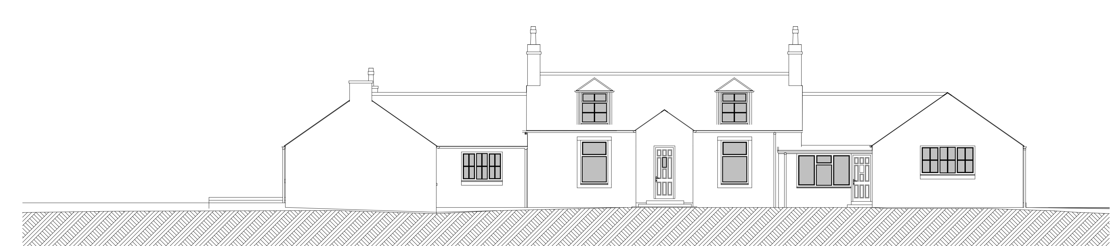
back (SOUTH EAST) ELEVATION