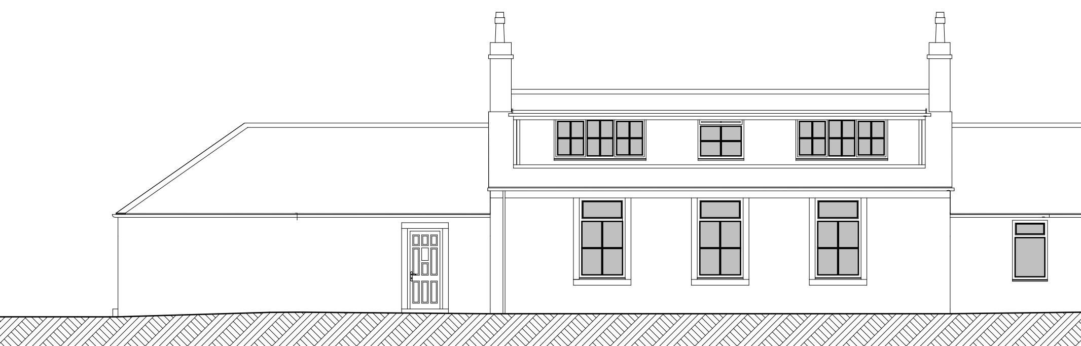
FRONT (NORTH WEST) ELEVATION