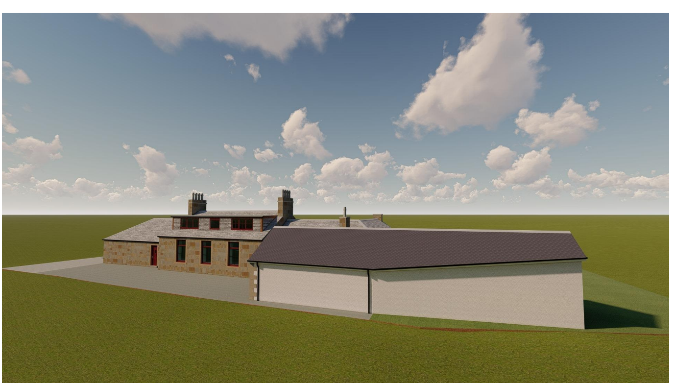
back (SOUTH EAST) ELEVATION