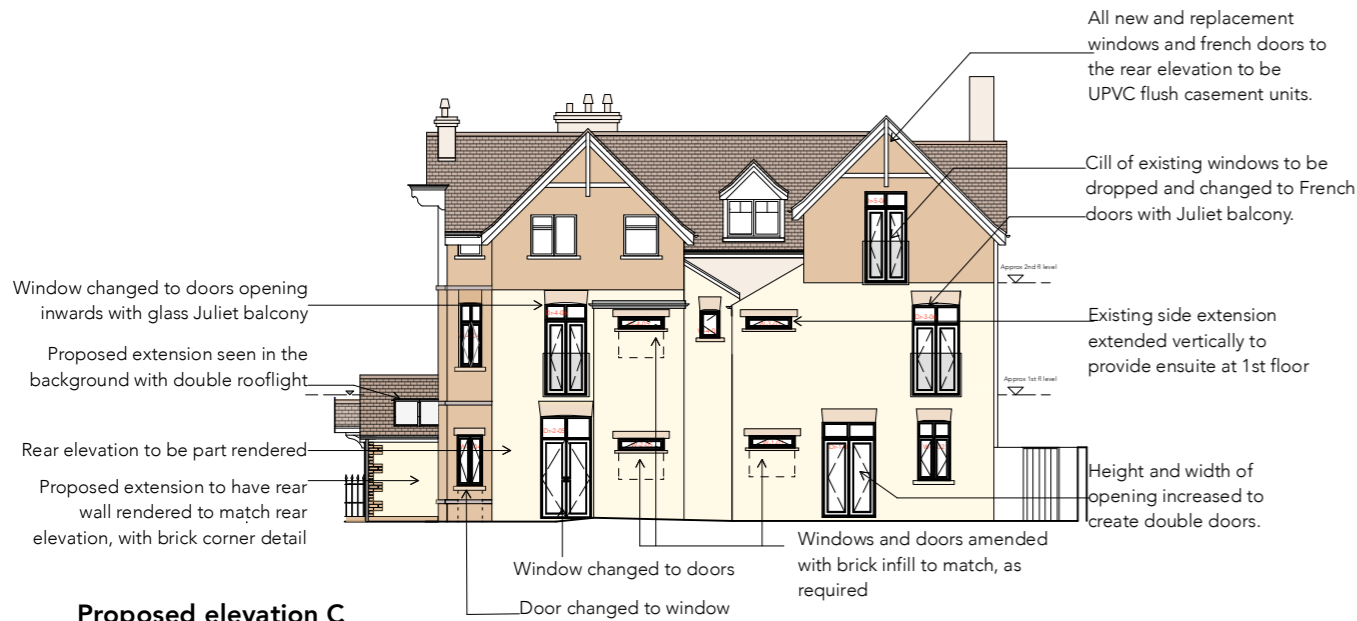
Proposed elevation C Scale 1:200