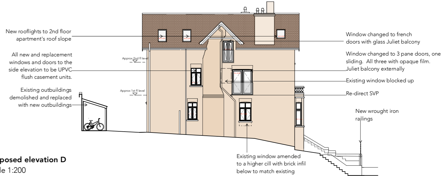
Proposed elevation D Scale 1:200