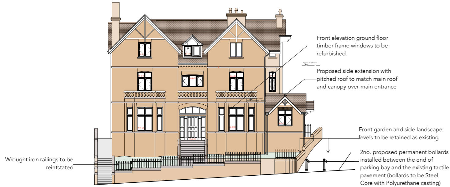
Proposed elevation A Scale 1:200