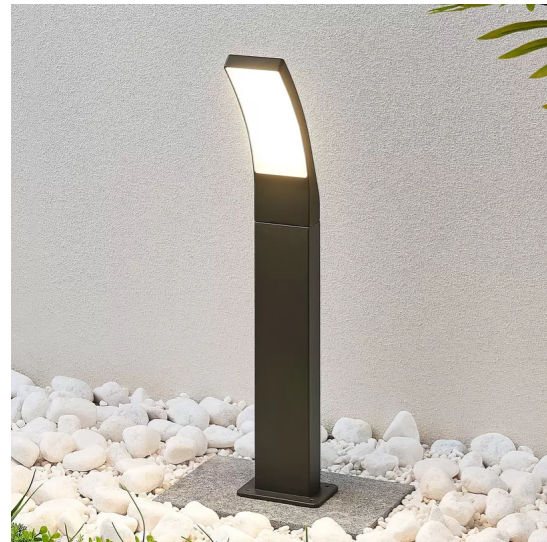
Lindby Ilvita LED path light, Anthracite