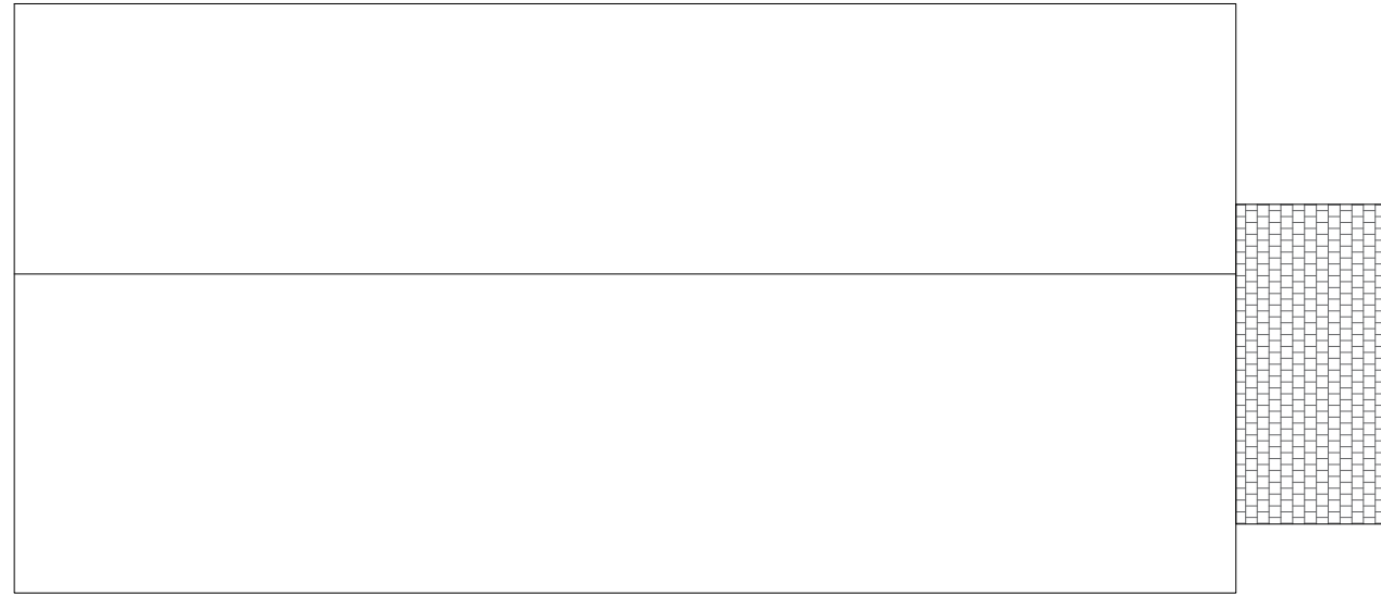
R O O F P L A N