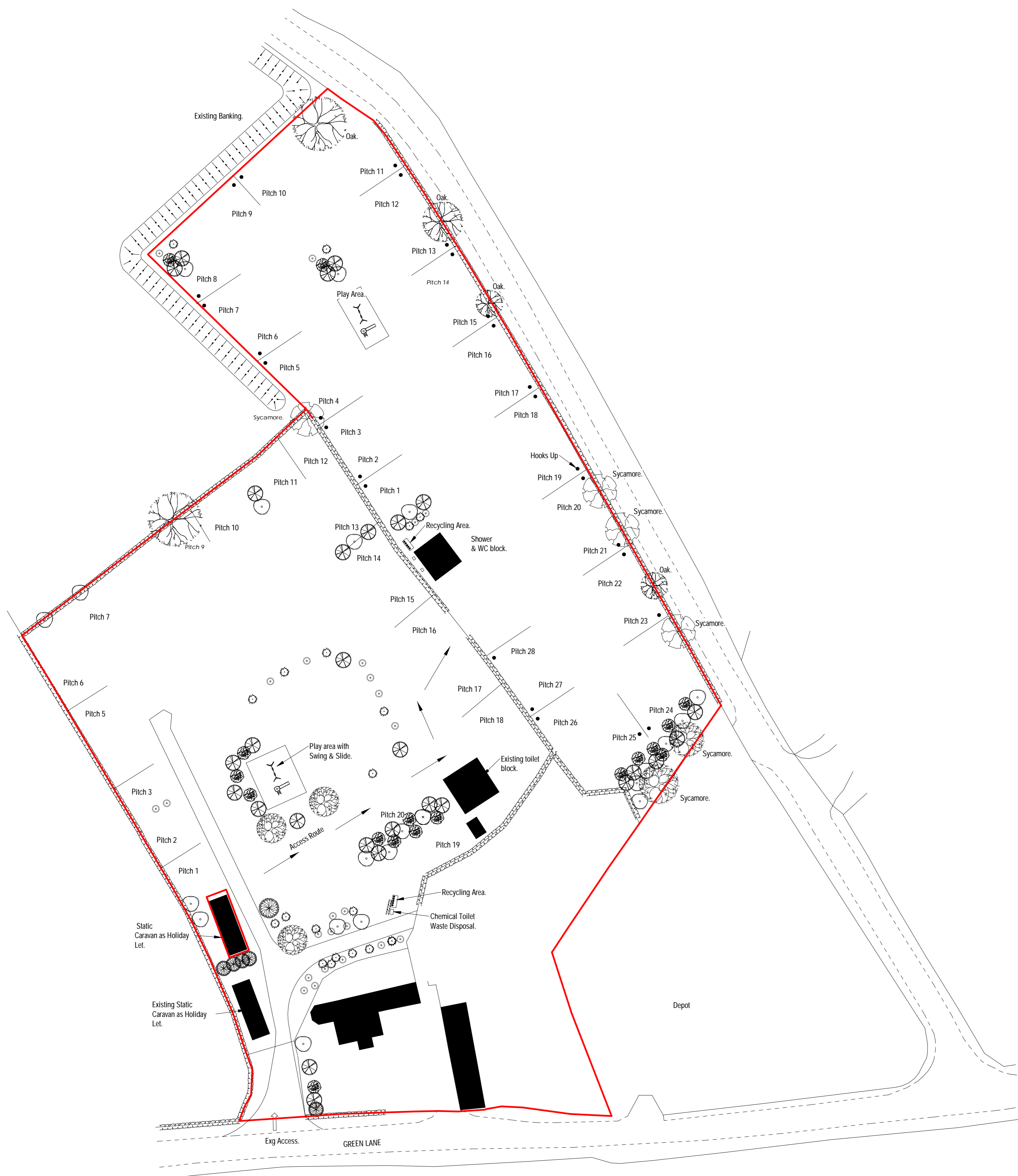
APPROVED SITE PLAN SCALE 1-500