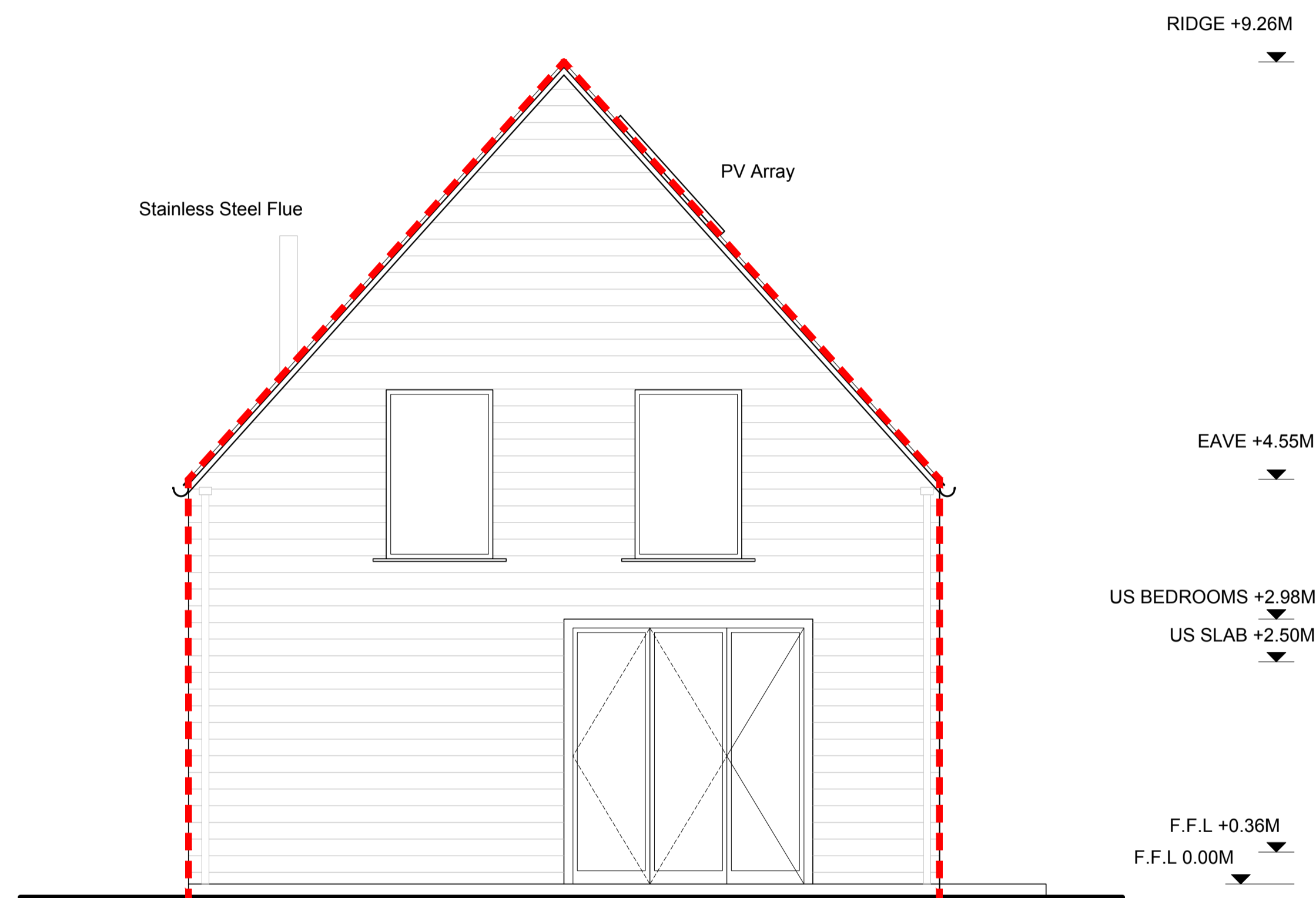
01 WEST ELEVATION SCALE 1:50 @ A1