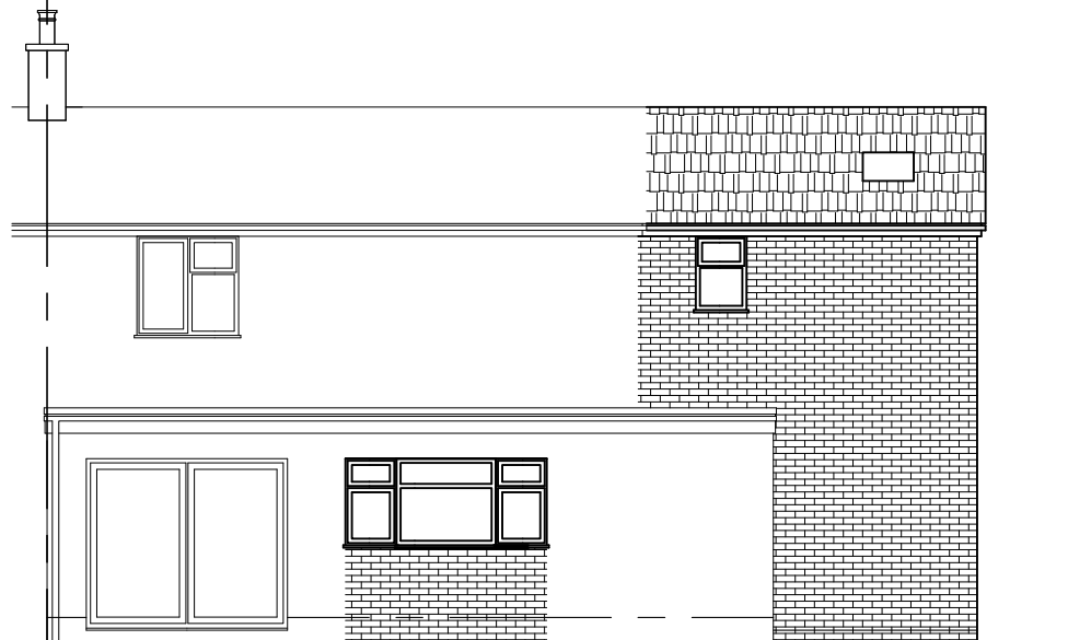
REAR (SOUTH) ELEVATION