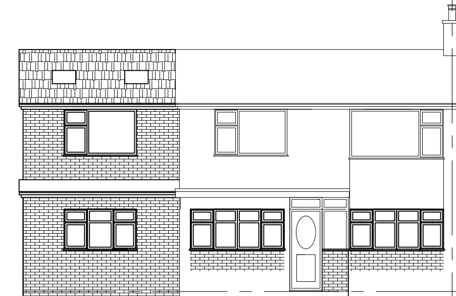
FRONT (NORTH) ELEVATION