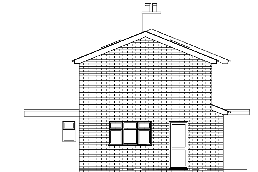
SIDE (EAST) ELEVATION