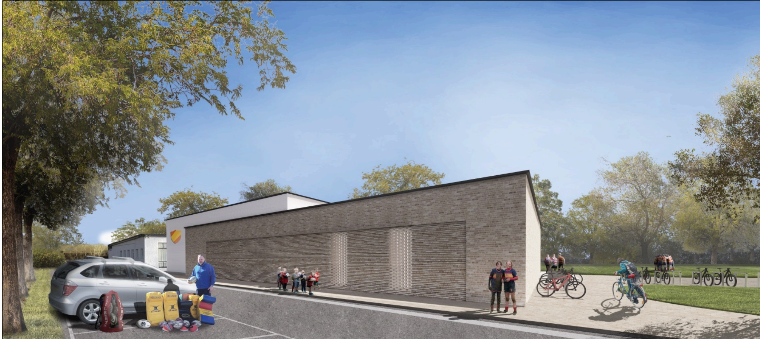
View from Glasgow Road Entrance