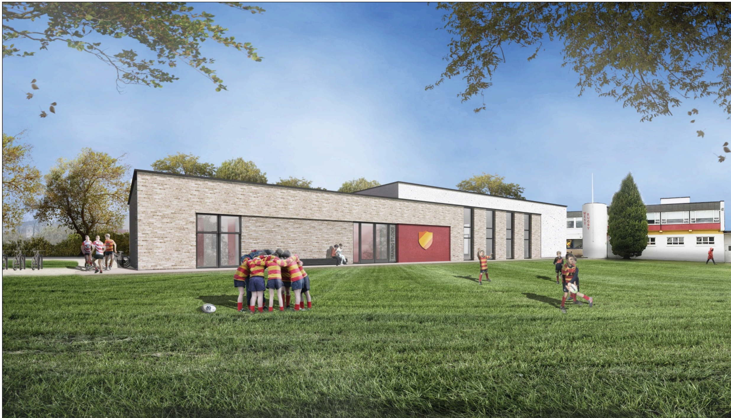
View from the Quad