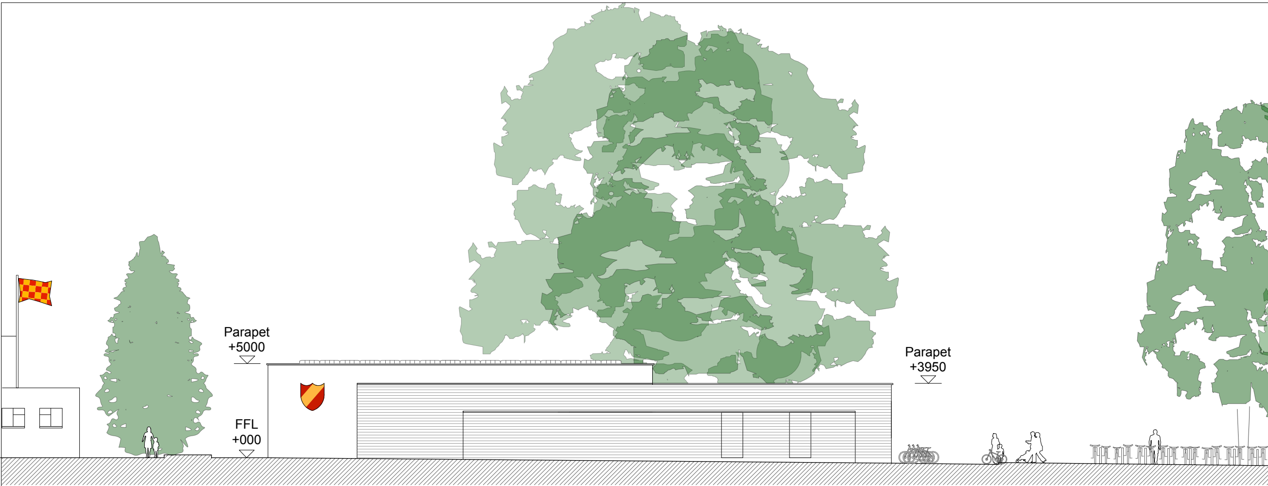
C - North Elevation