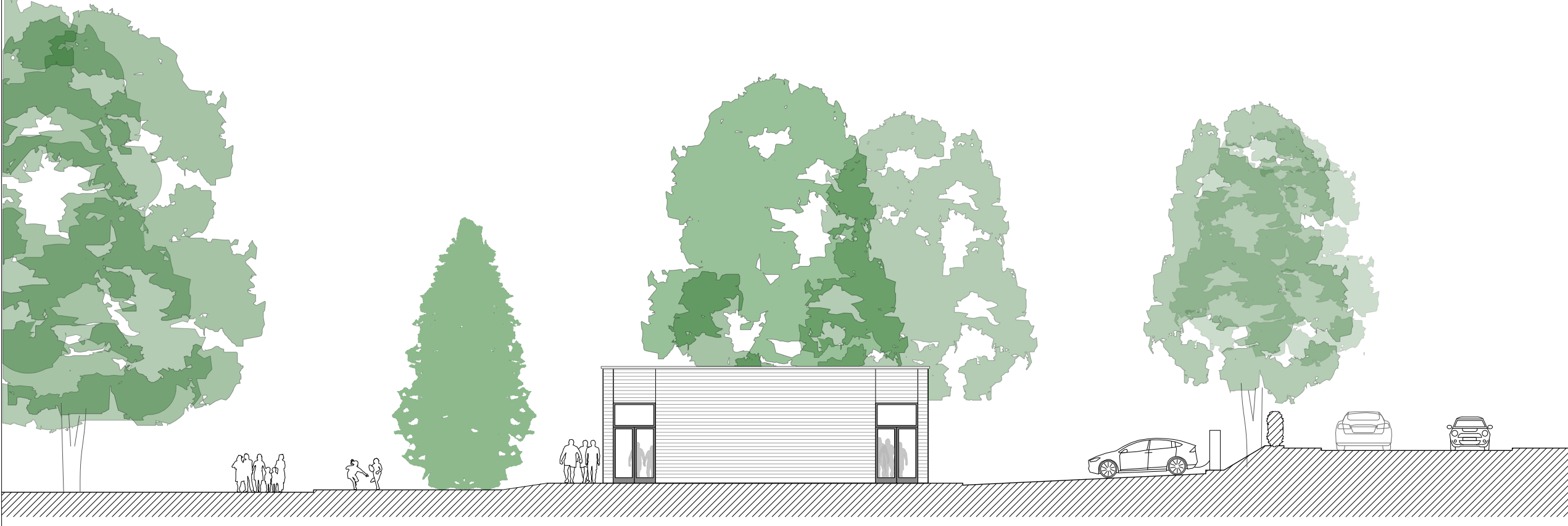
D - East Elevation