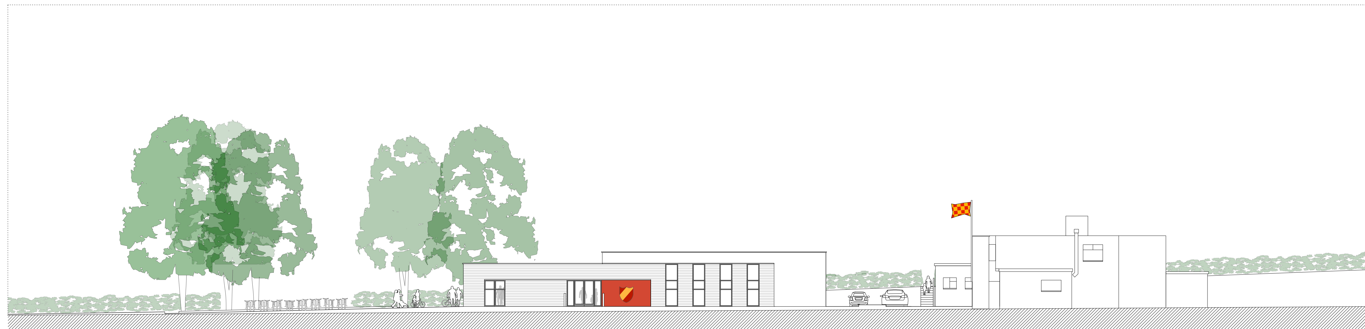
E - South Elevation