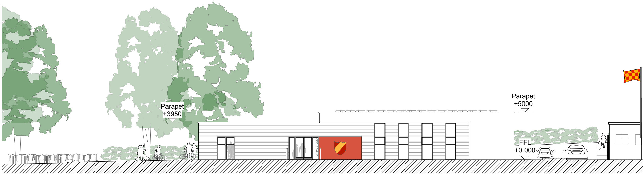
A - South Elevation