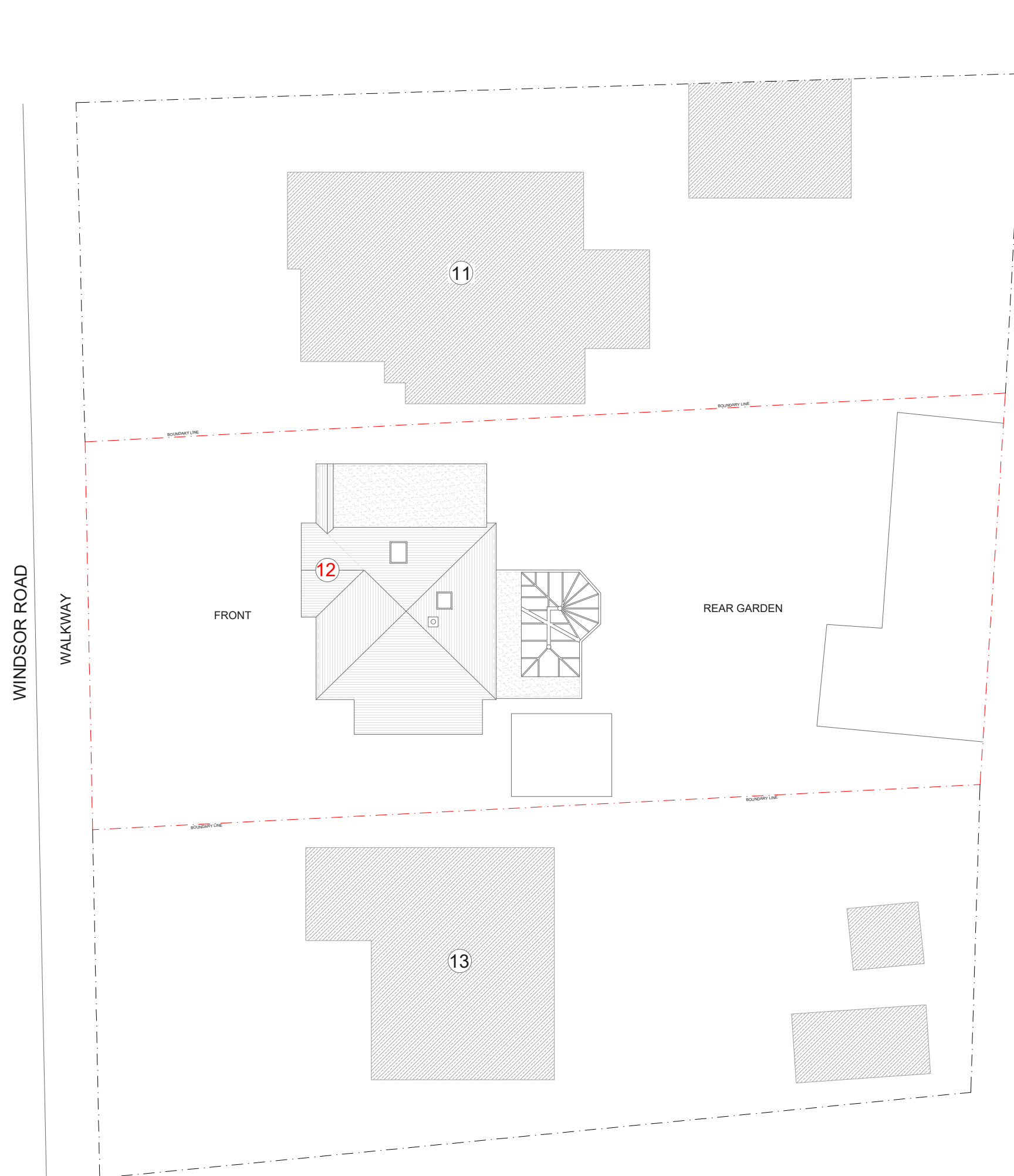
EXISTING SITE/BLOCK PLAN SCALE 1:200