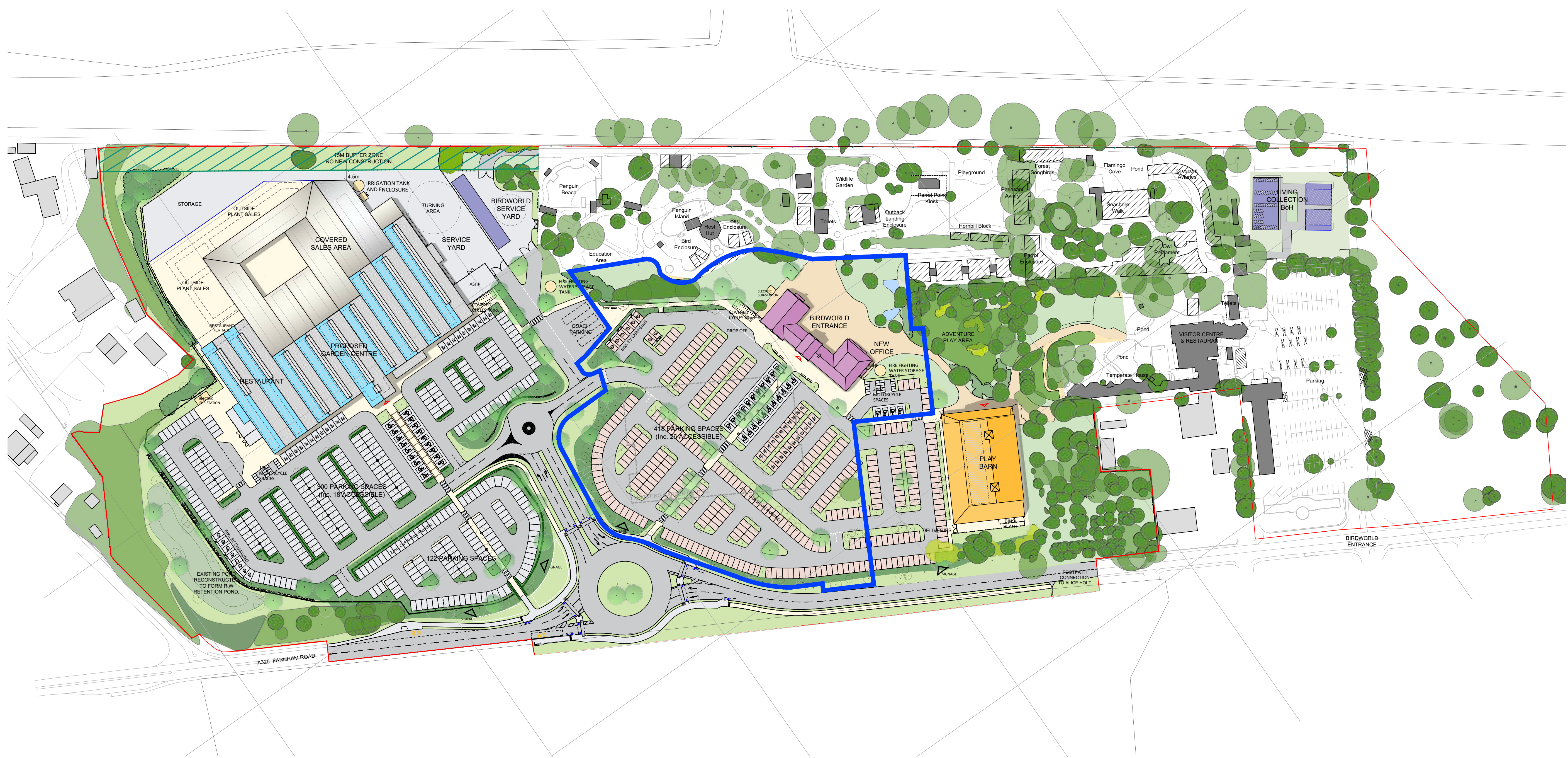
PHASE 3 Demolition of existing Garden Centre and construction of new Birdworld Entrance Building and parking