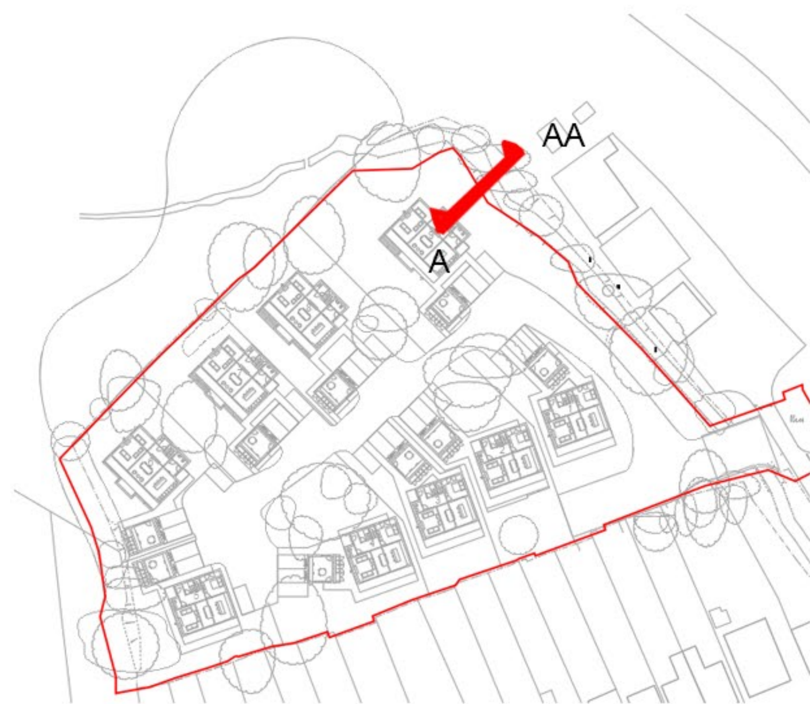
Section location plan - not to scale

A proposed native woodland of willow, alder and downy birch, with grassland and wetland habitats associated with the River Wey will be created to enhance biodiversity and landscape character, while improving water quality and water storage.