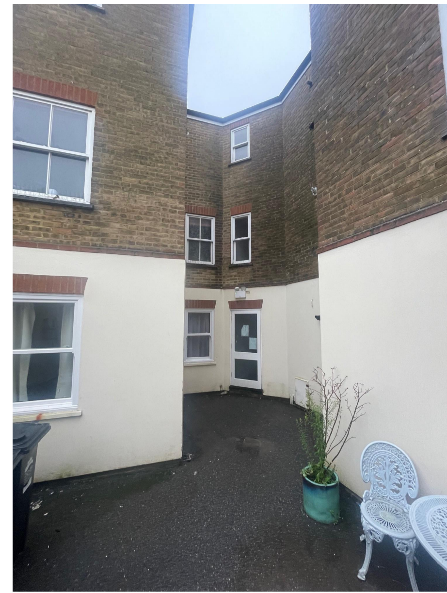
8 Rear South East View 1:4.44