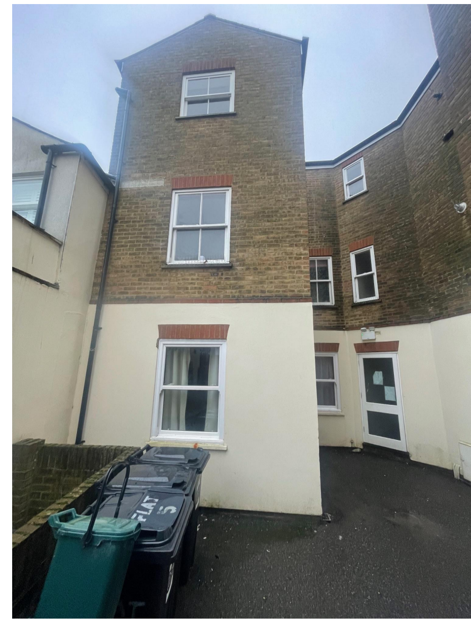
9 Rear East View 1:4.44