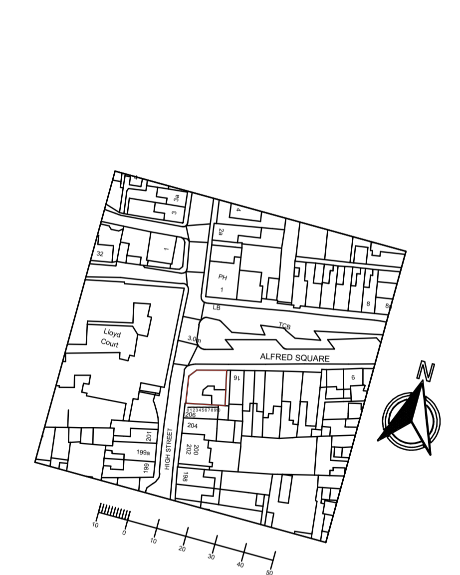
1 Location Plan 1:1250