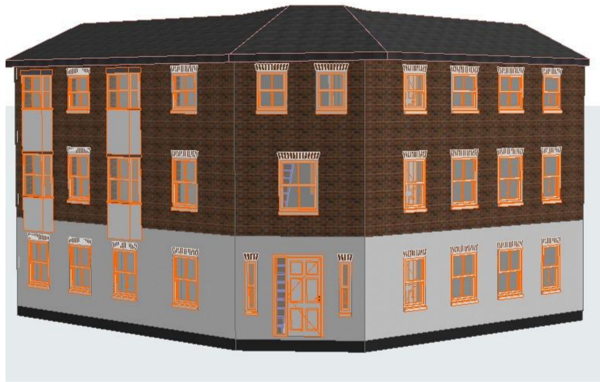
10 3D Front Proposed (Not Materials) 1:100