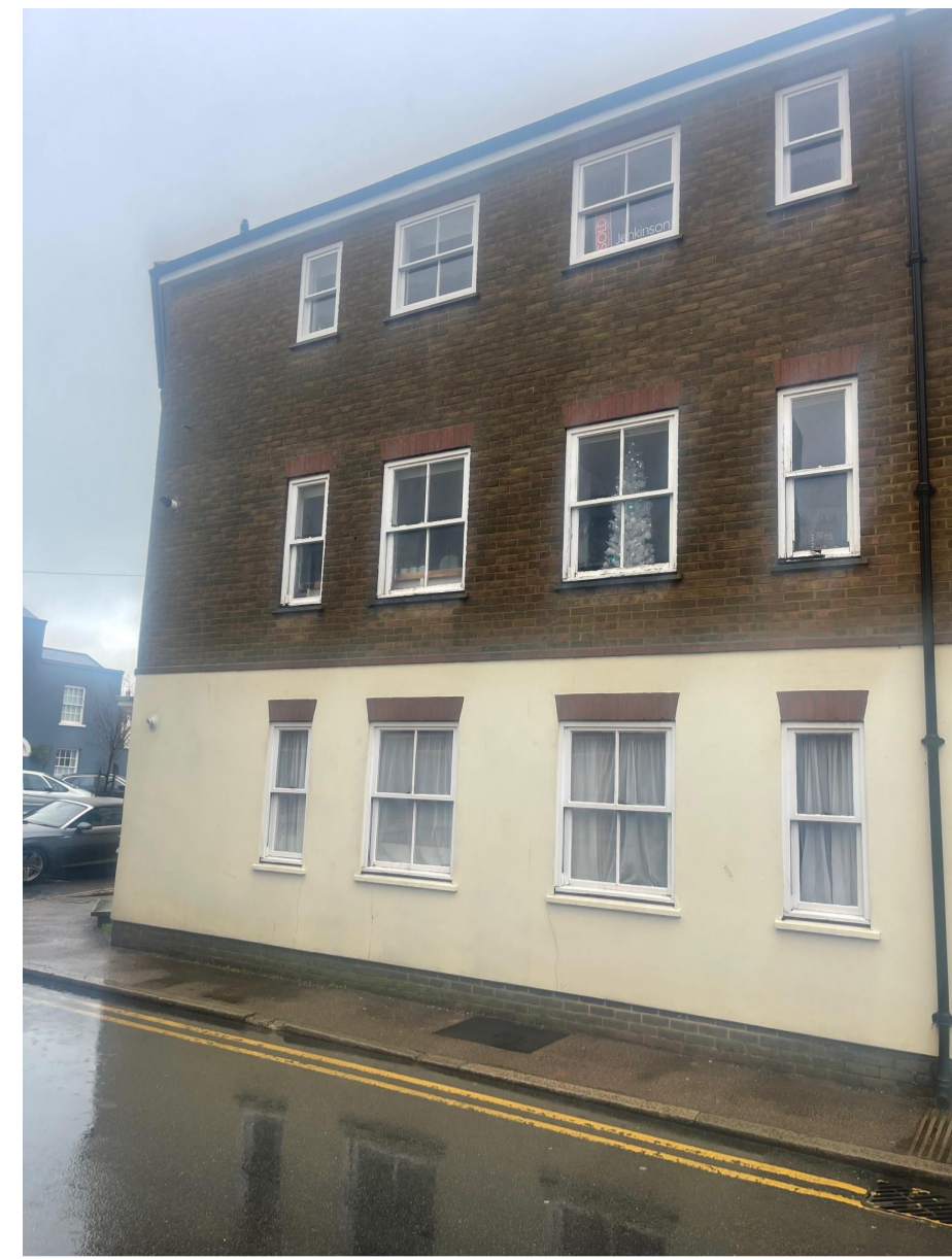
6 West View 1:4.44