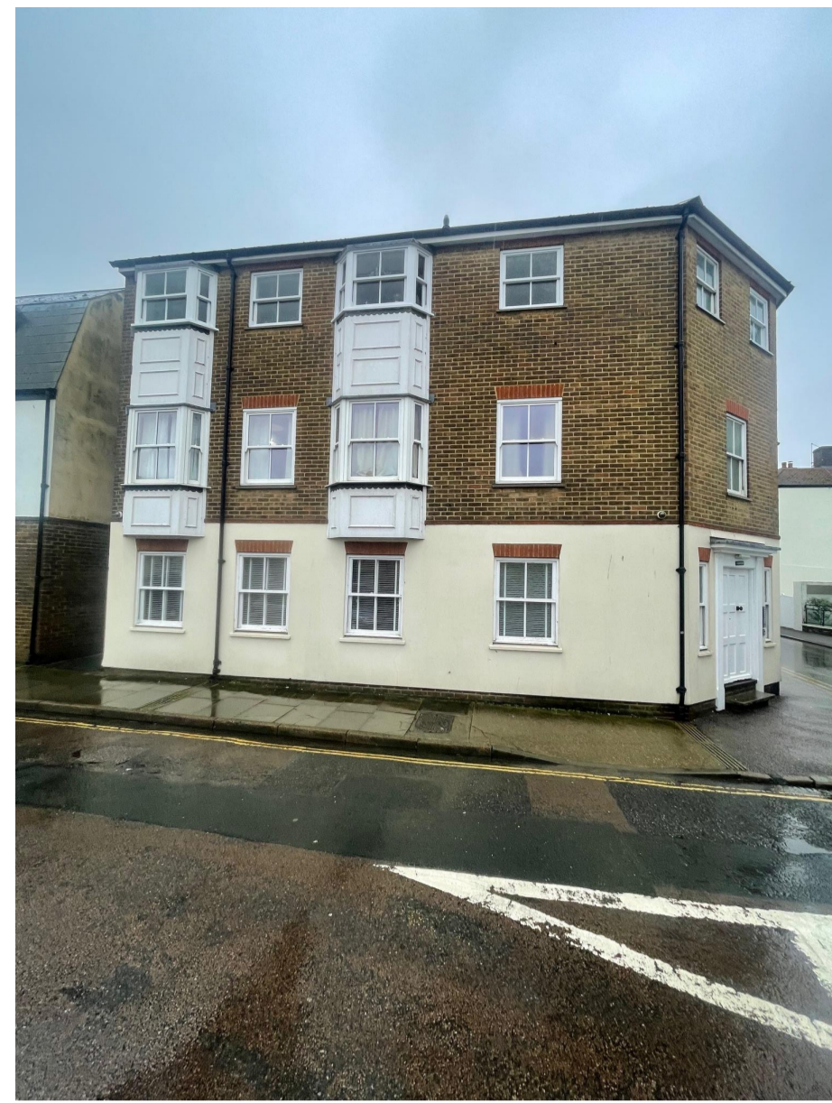
4 North View 1:4.44