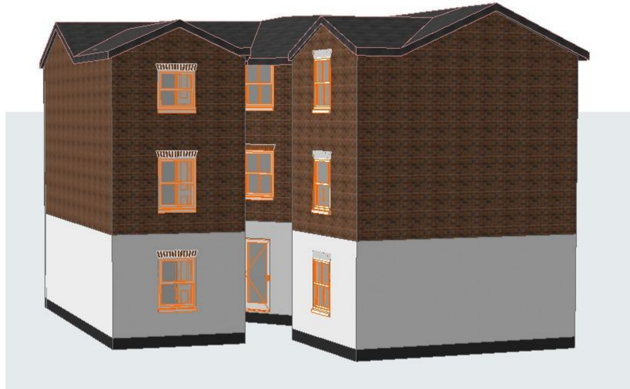
11 3D Rear Proposed (Not Materials) 1:100

This document and its design content is copyright ©. It shall be read in conjunction with all other associated project information including models, specifications, schedules and related consultants documents. Do not scale from documents. All dimensions to be checked on site. Immediately report any discrepancies, errors or omissions on this document to the Originator. If in doubt ASK.