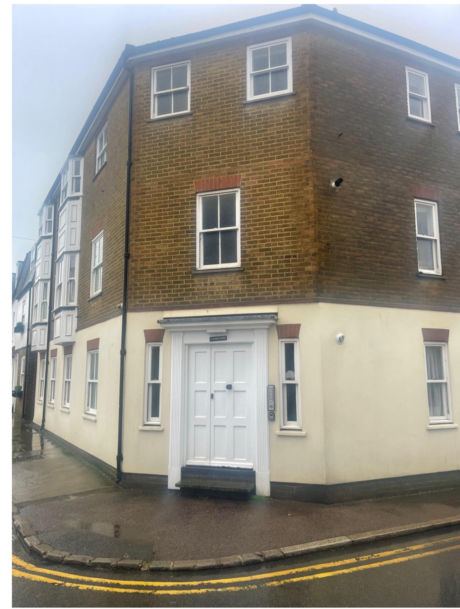
5 North West View 1:4.44