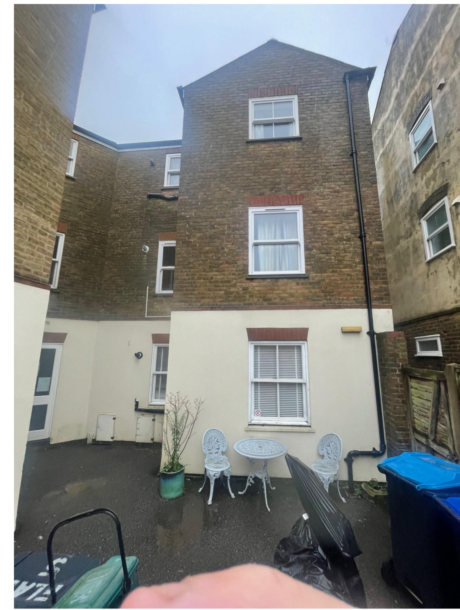
7 Rear South View 1:4.44