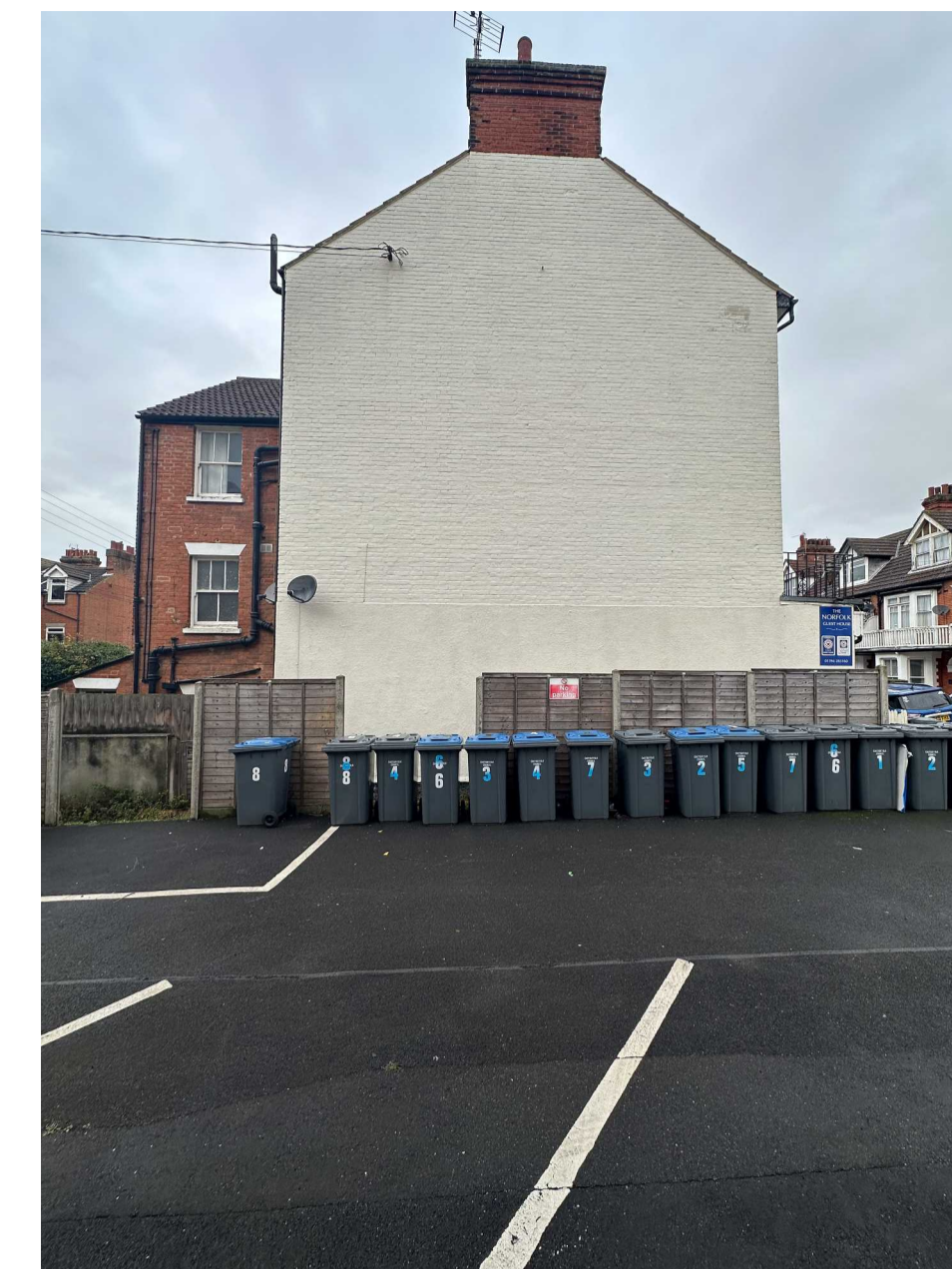
2 East Elevation - No Changes Scale: 1:100