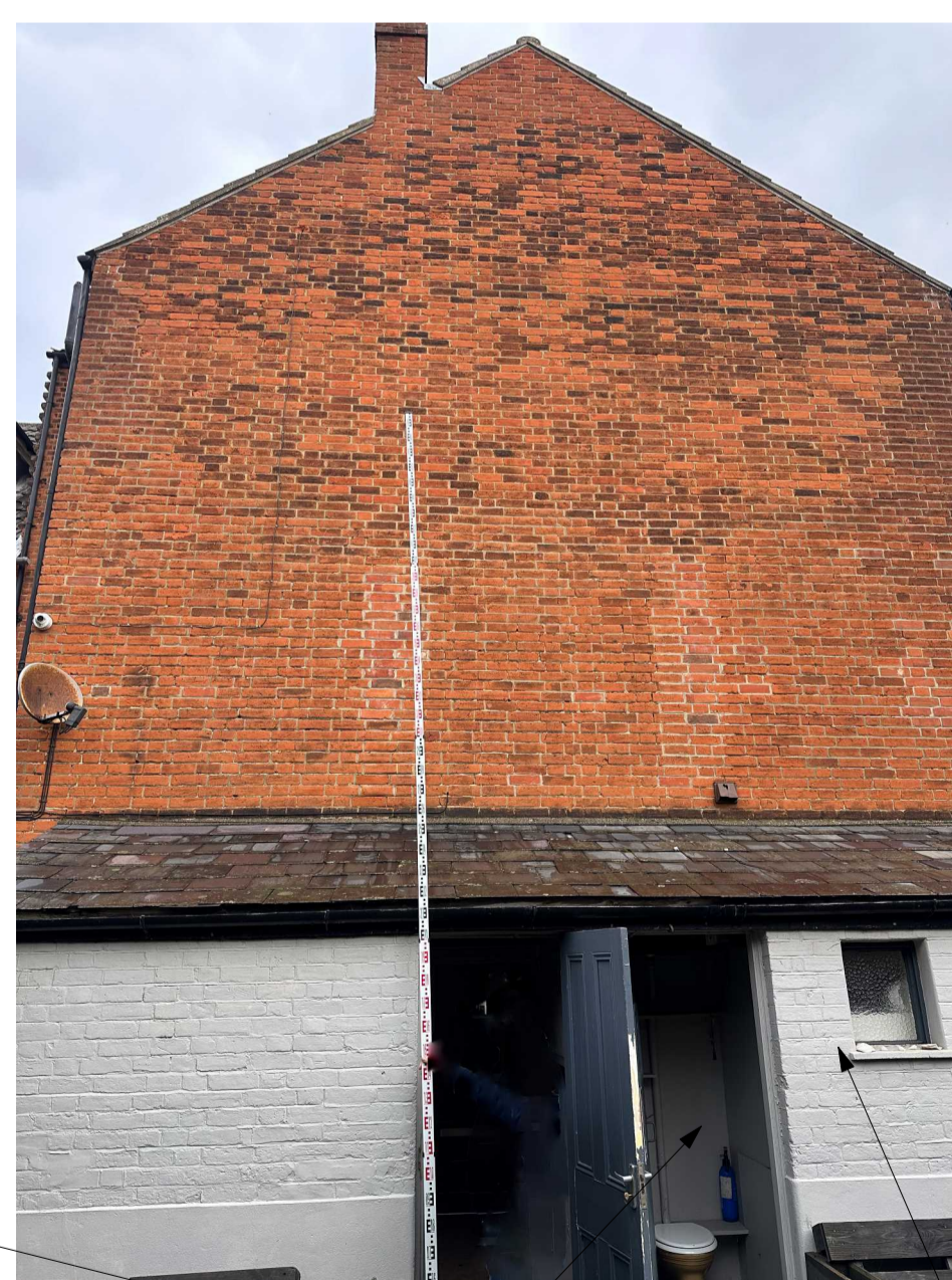
6 South - Removal of doors from rear lean-to Scale: 1:100