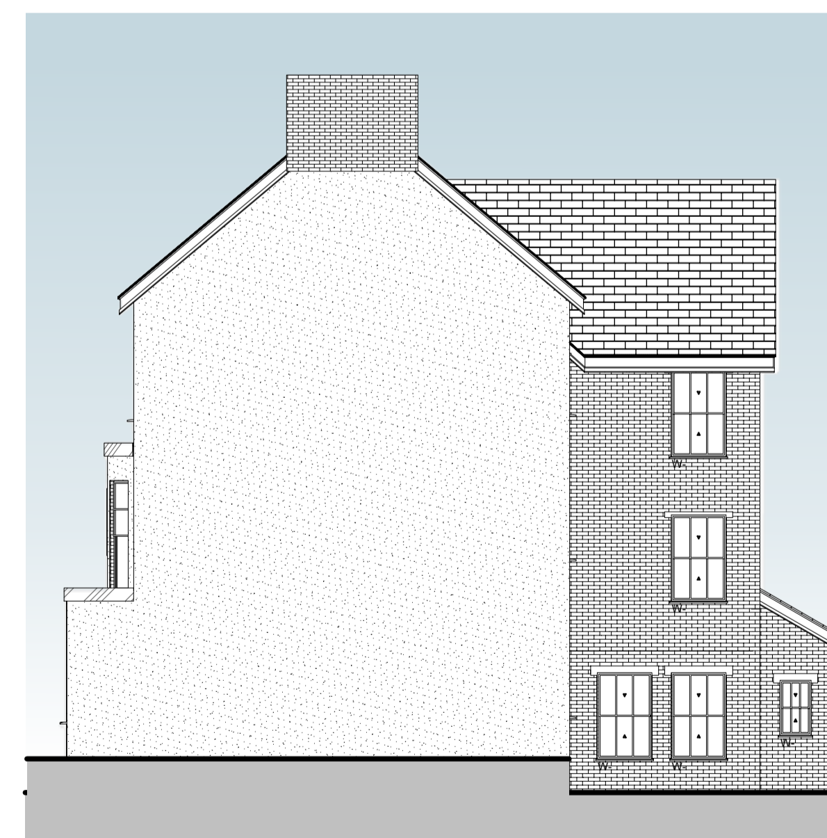
5 West Elevation - No Changes Scale: 1:100