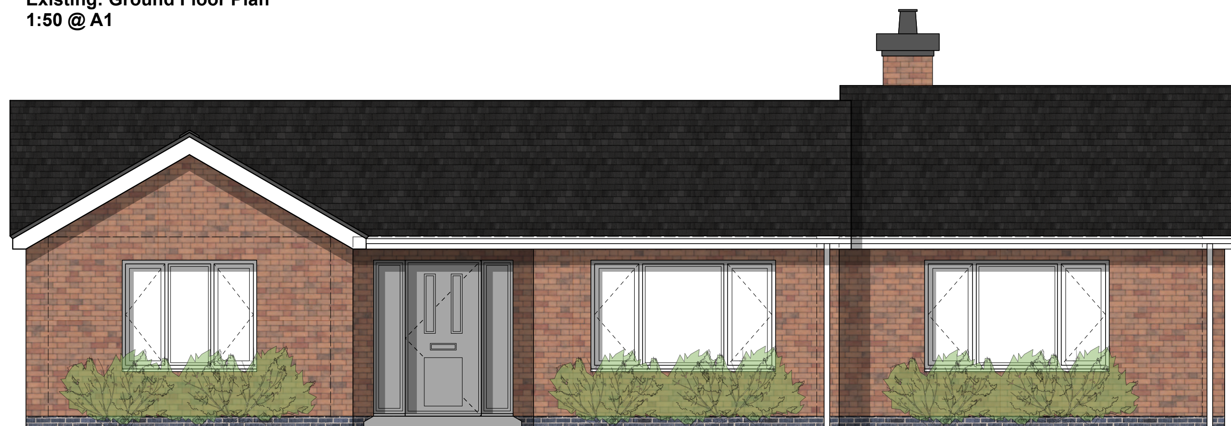
Existing: Front Elevation 1:50 @ A1

REVISIONS REV: DATE - DRAWN - CHECKED: NOTES - 19.01.2024 - CSE: Drawing created.