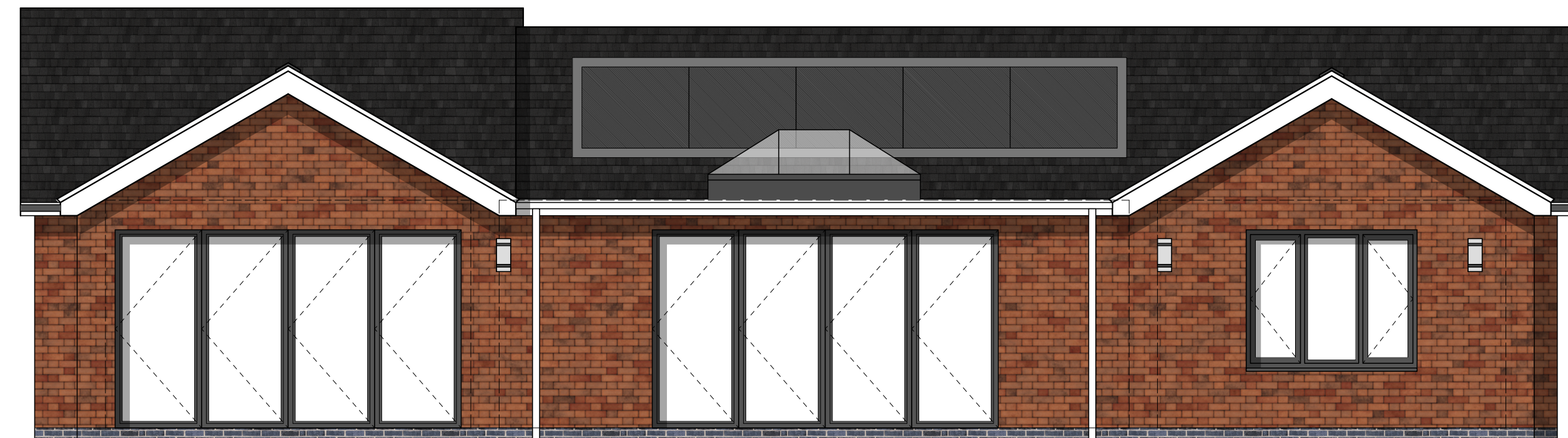
Proposed: Rear Elevation 1:50 @ A1