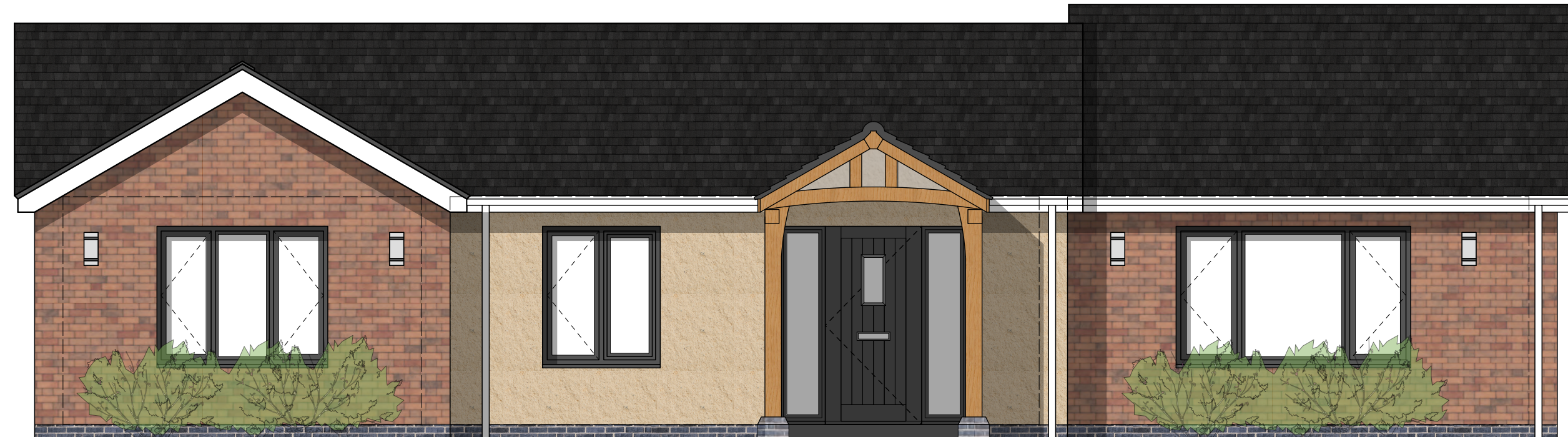
Proposed: Front Elevation 1:50 @ A1