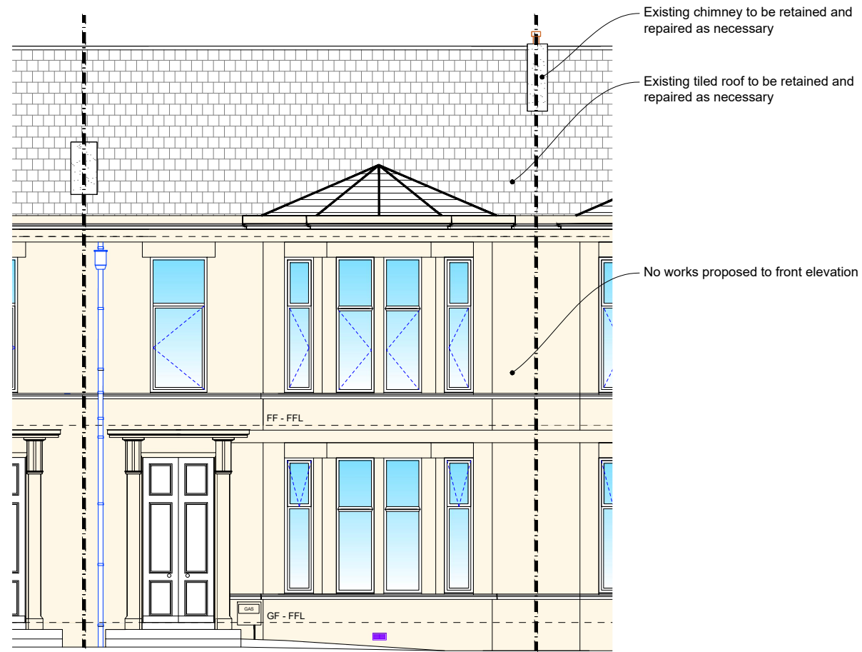
Front Elevation (Elevation A) Scale: 1/100 @ A3