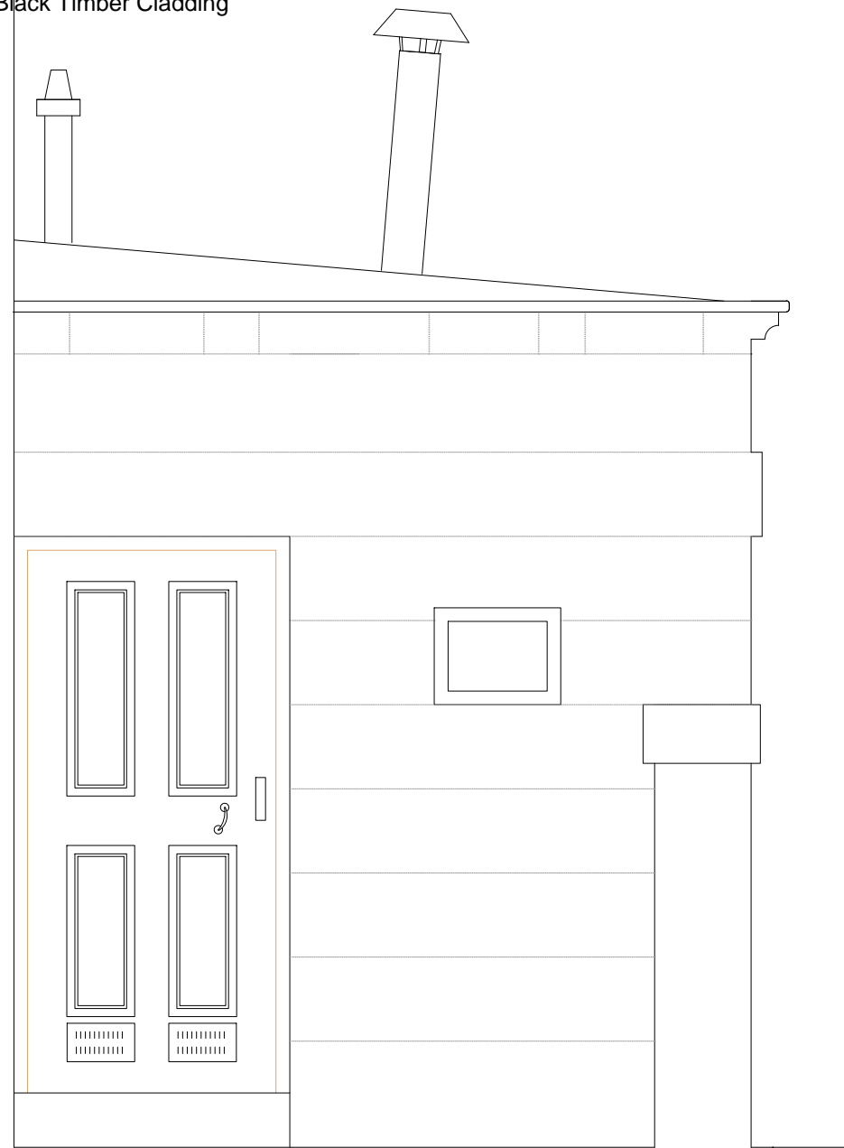
North West Elevation as Existing - 1:25