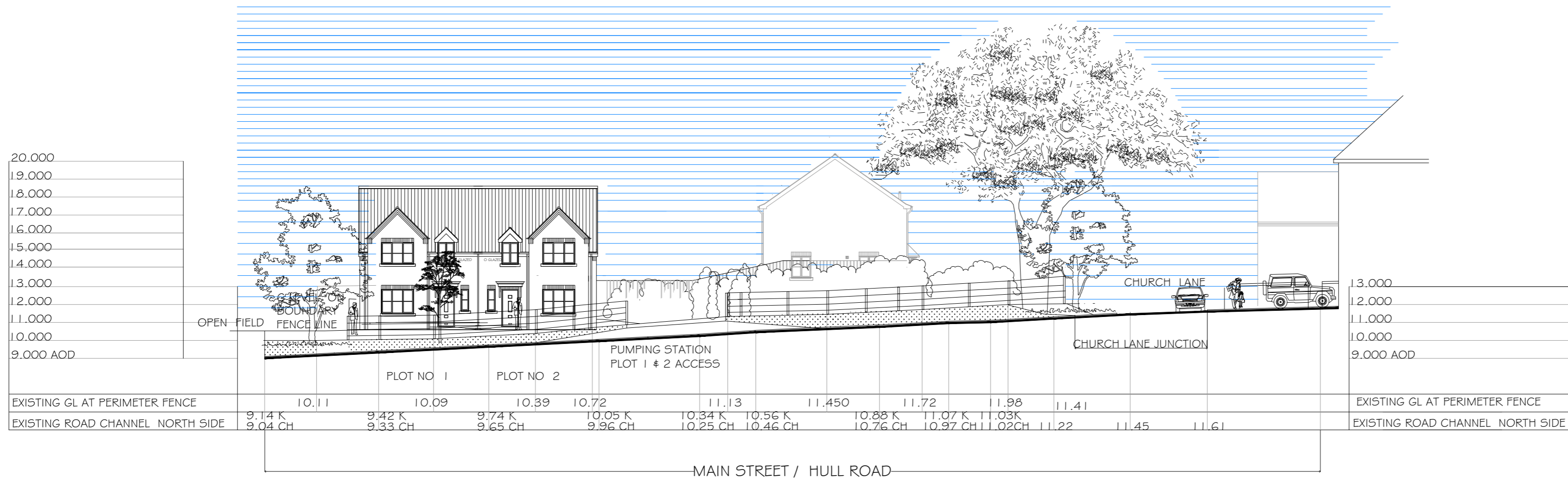
STREET SCENE D - D ALONG MAIN STREET - WEST TO EAST SCALE 1 : 200 VERTICALLY & HORIZONTALLY