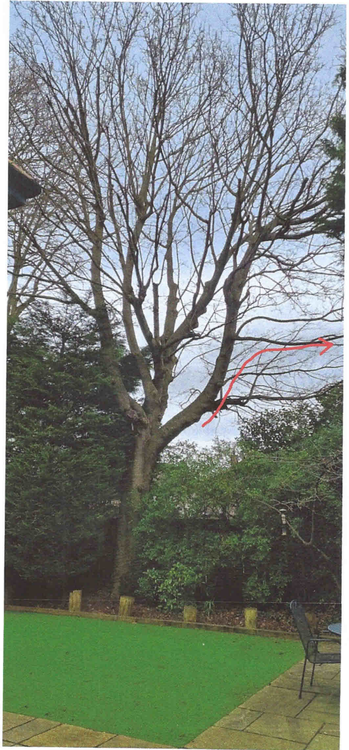
T4: lift by approx. 2m tertiary branches