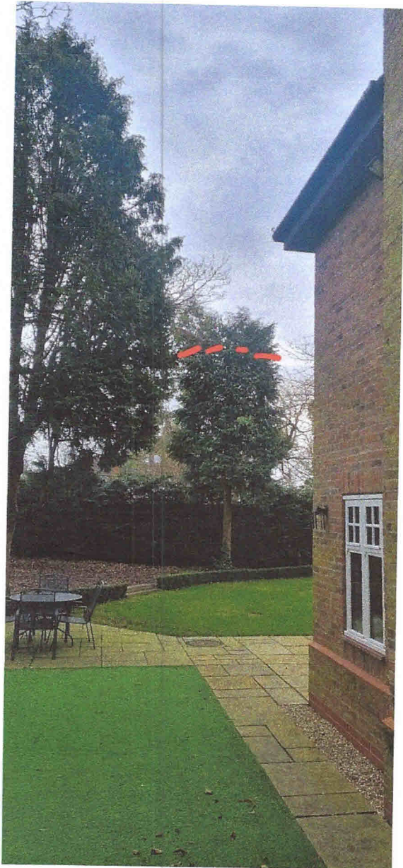
T2 Cypress: Reduce by approx. 1m