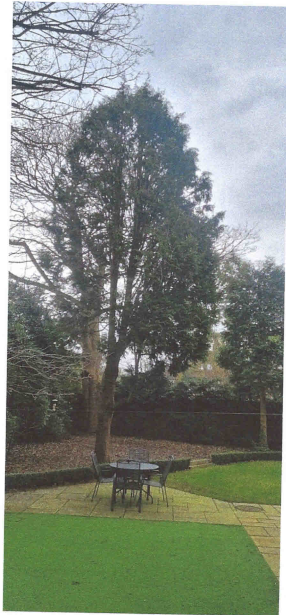
T1 Cypress: Fell