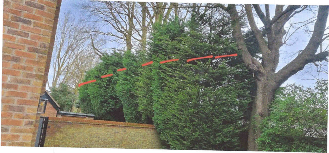
G1: Reduce height by approx. 2.5m