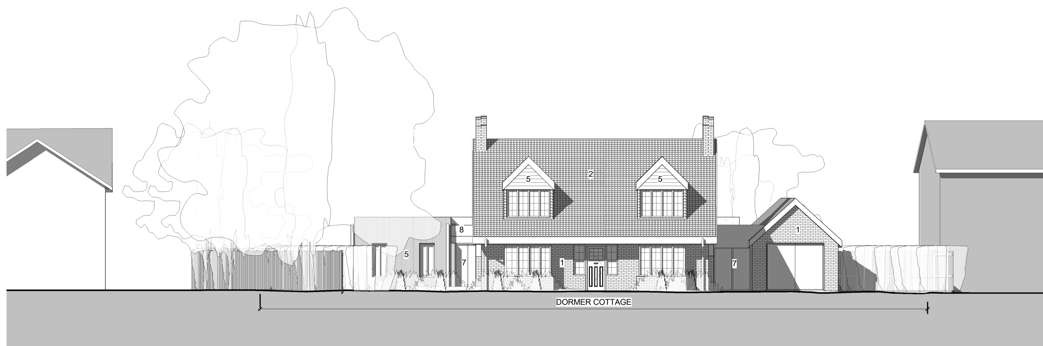
Prop South front 1 : 100