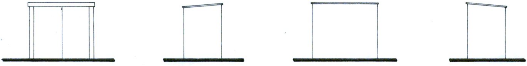
Bin store 1:50