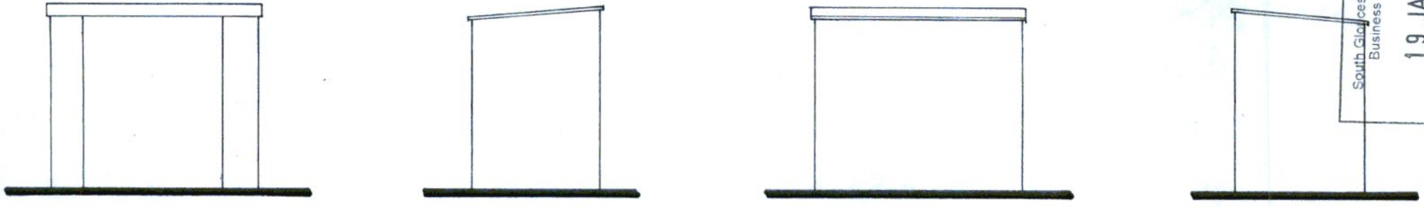
Cycle store 1:50

South Gloucestershire Council Business Support - 7 19 JAN 2024 Received