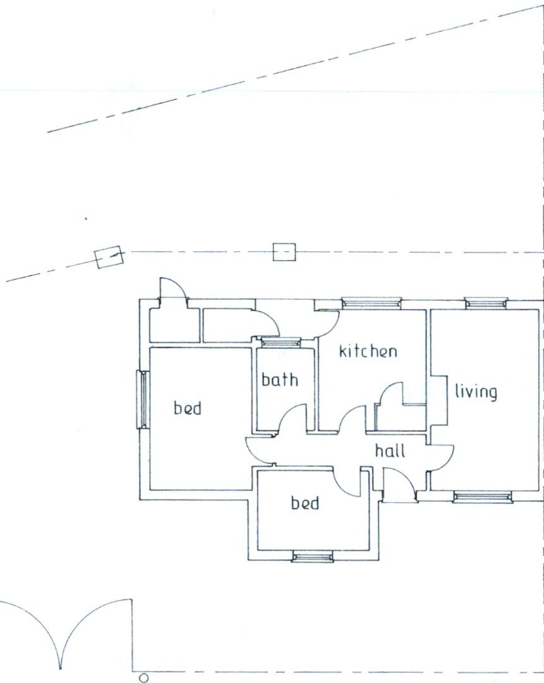
Floor Plan 1:100