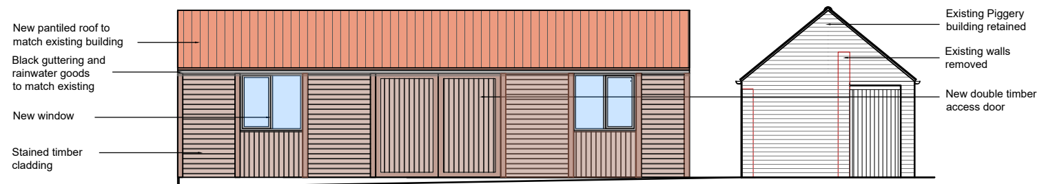
Proposed West Elevation 1:100