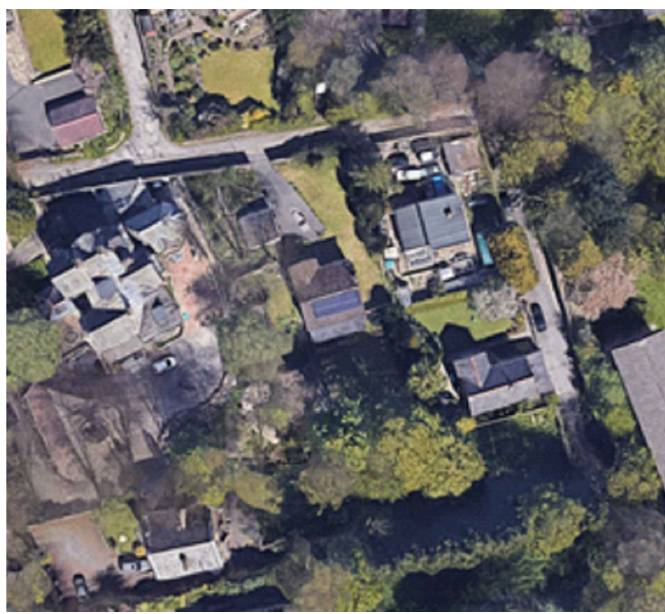
Site Aerial View