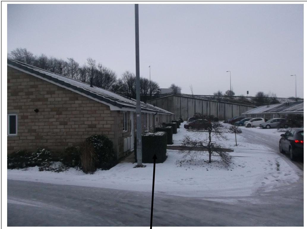
Bin storage areas

Below are some photographs of the development at Weavers Fold: