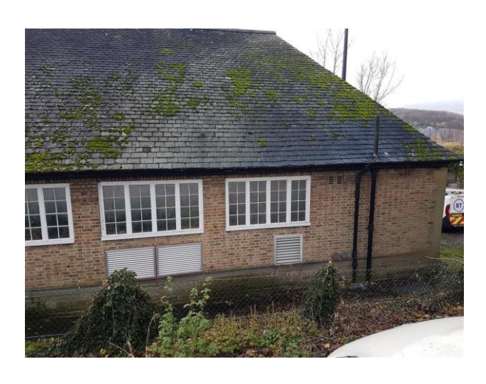
EAST ELEVATION – EXISTING LOUVRES