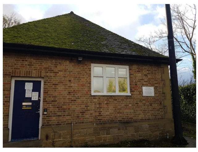
SOUTH ELEVATION – OPPOSITE STATION ROAD