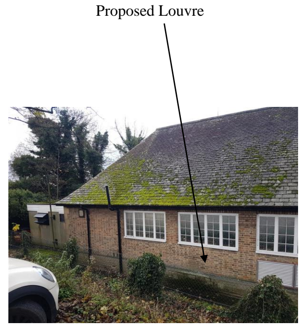
WEST ELEVATION – OPPOSITE RAILWAY LINES EAST ELEVATION – OPPOSITE VETS PRACTICE