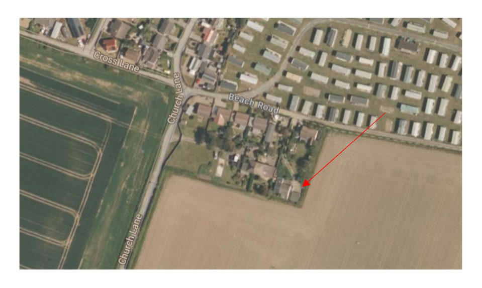
Satellite Image of "Fieldview"

The application site is located on the southern side of Beach Road in Eccleson-Sea, Norwich.