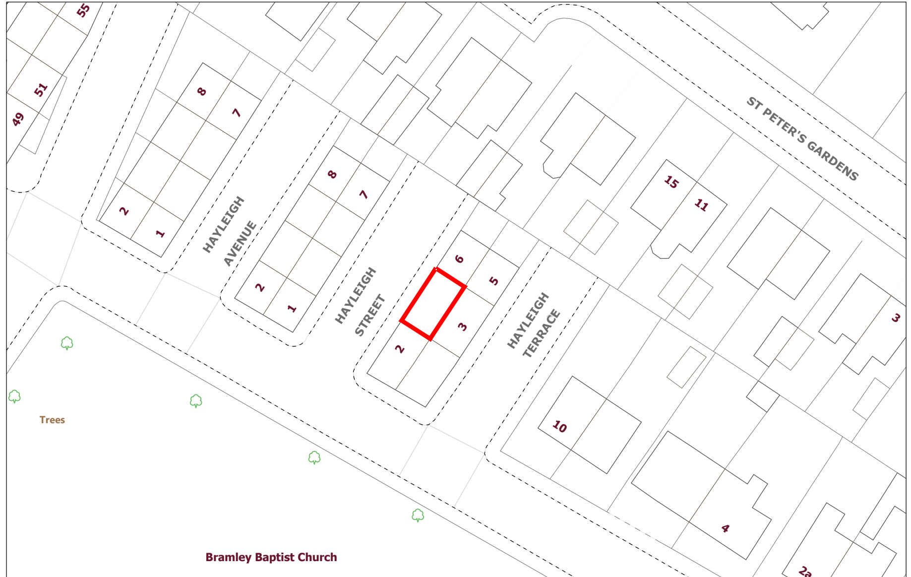
SITE PLAN - 1:500 @ A3