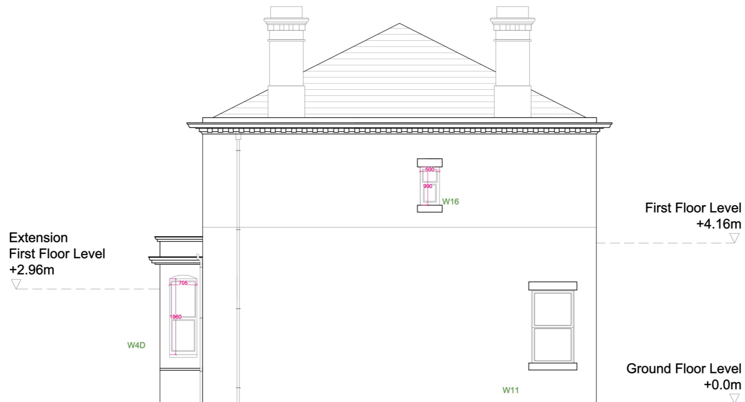
1 Proposed Side Elevation 1