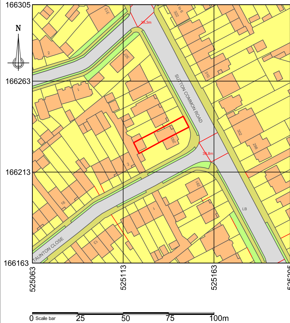
Site plan proposed 1:500