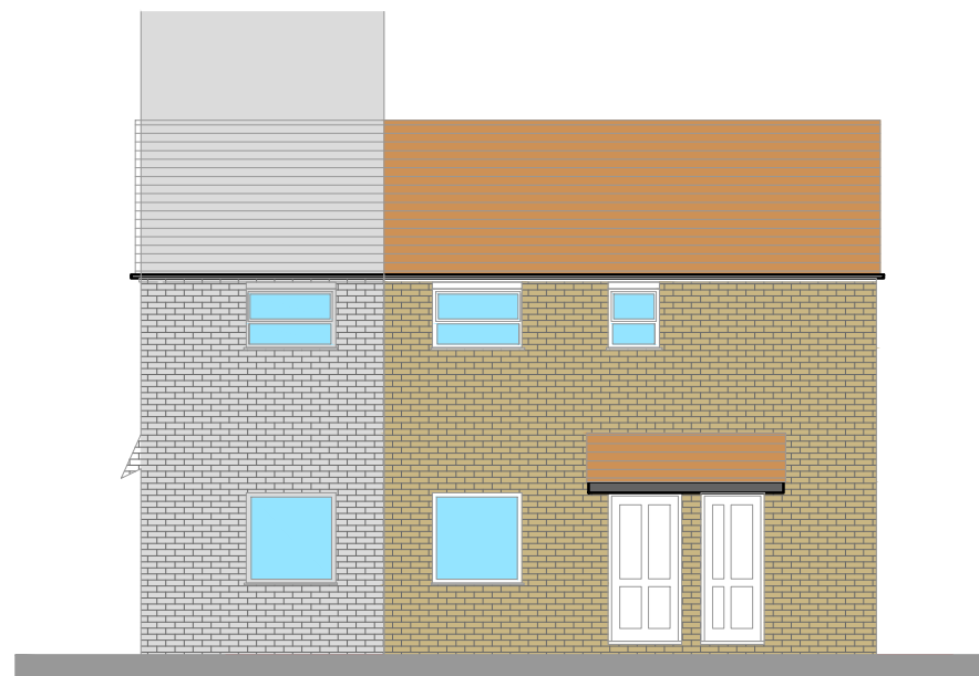
Existing - Front Elevation Scale : 1:100