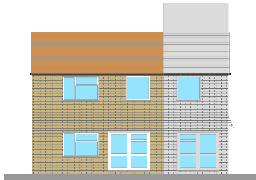
Existing - Back Elevation Scale : 1:100