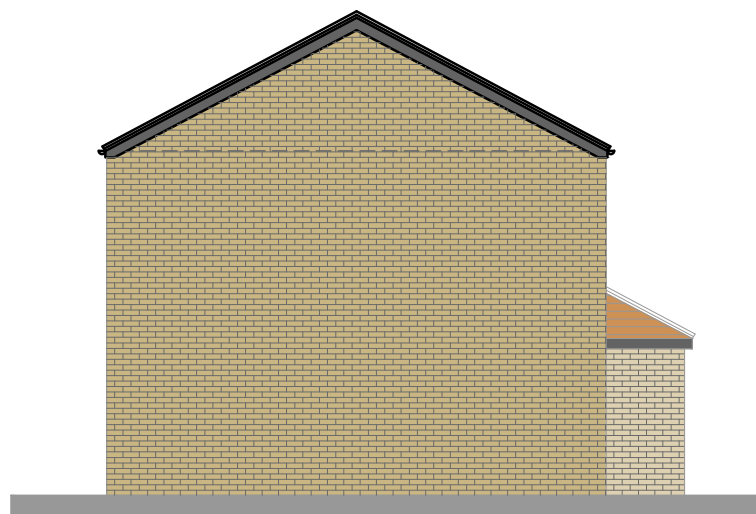
Existing - Side A Elevation Scale : 1:100