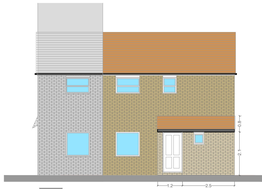
Proposed - Front Elevation Scale : 1:100