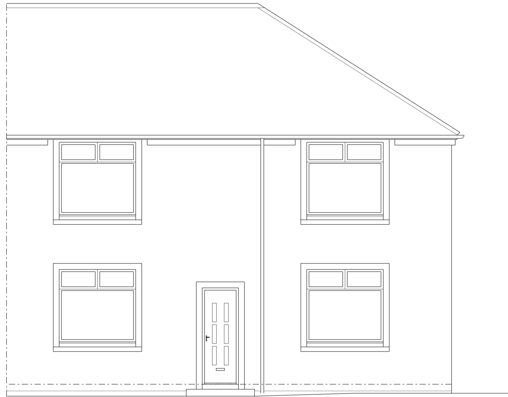
EAST ELEVATION AS EXISTING 1 : 50

NOTES: DO NOT SCALE FROM DRAWING. IF IN DOUBT ASK. WRITTEN DIMENSIONS TO BE RESPECTED. ALL DIMENSIONS TO BE CHECKED ON SITE. DRAWINGS TO BE READ IN CONJUNCTION WITH STRUCTURAL ENGINEERS INFORMATION AND SPECIFICATION.