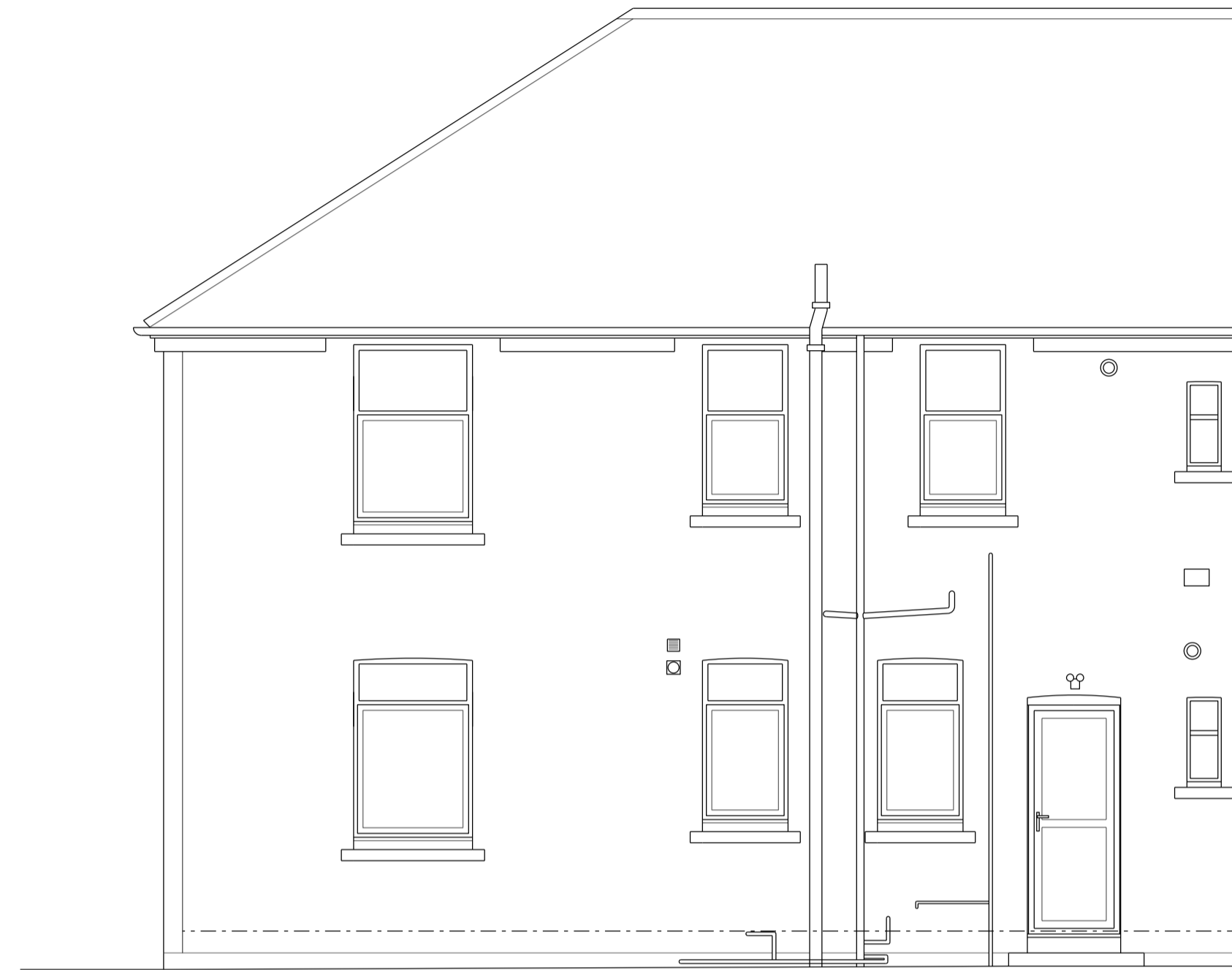
WEST ELEVATION AS EXISTING 1 : 50