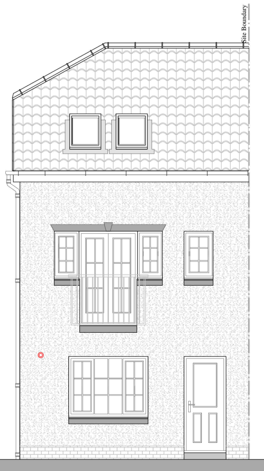
EXISTING NORTH - WEST ELEVATION 1:50