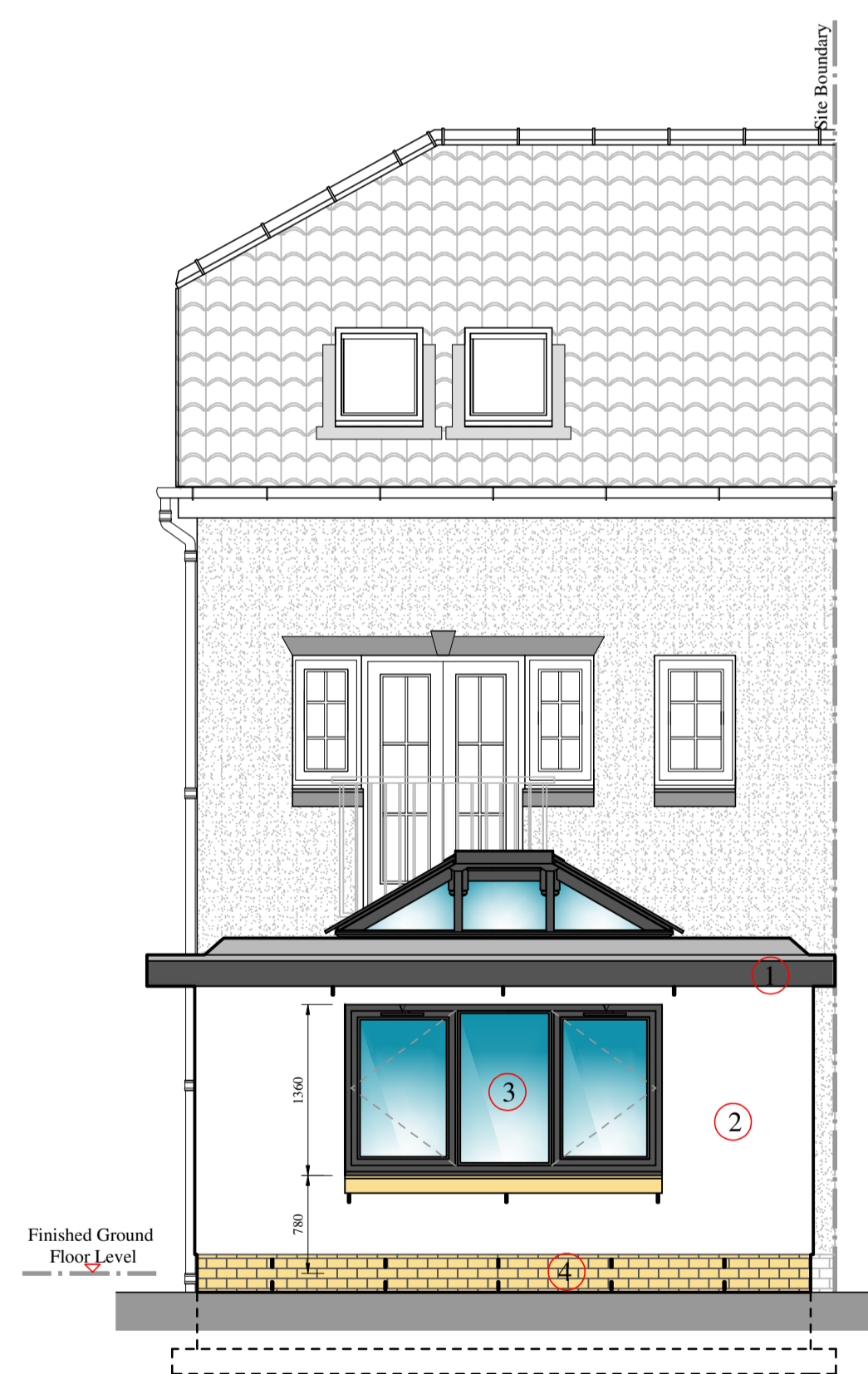
PROPOSED NORTH - WEST ELEVATION 1:50