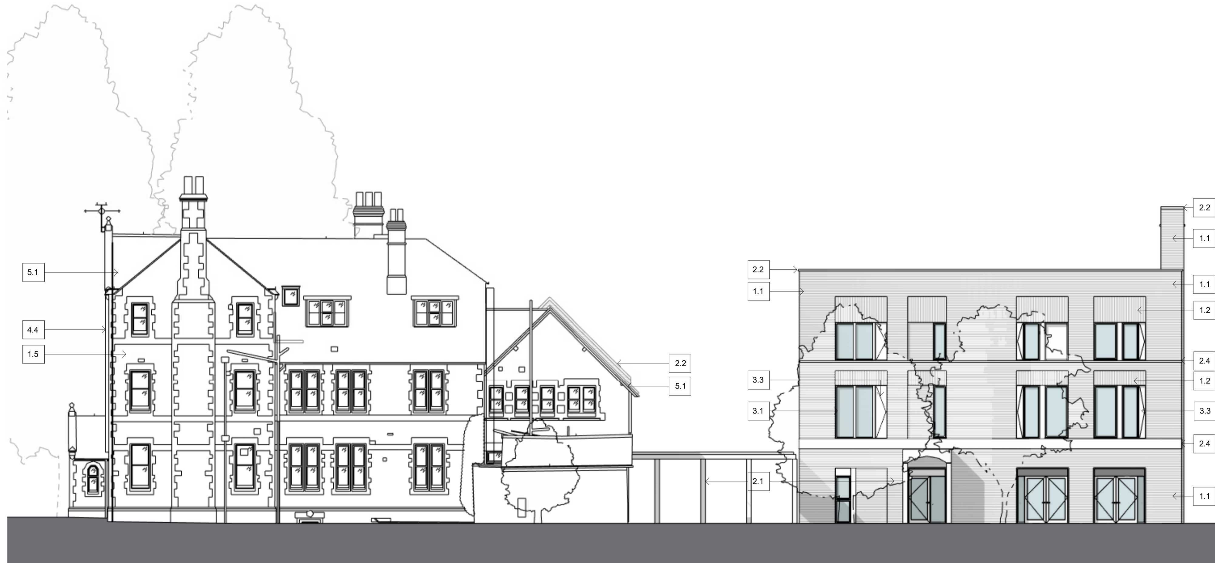
1 East Elevation 1 : 100