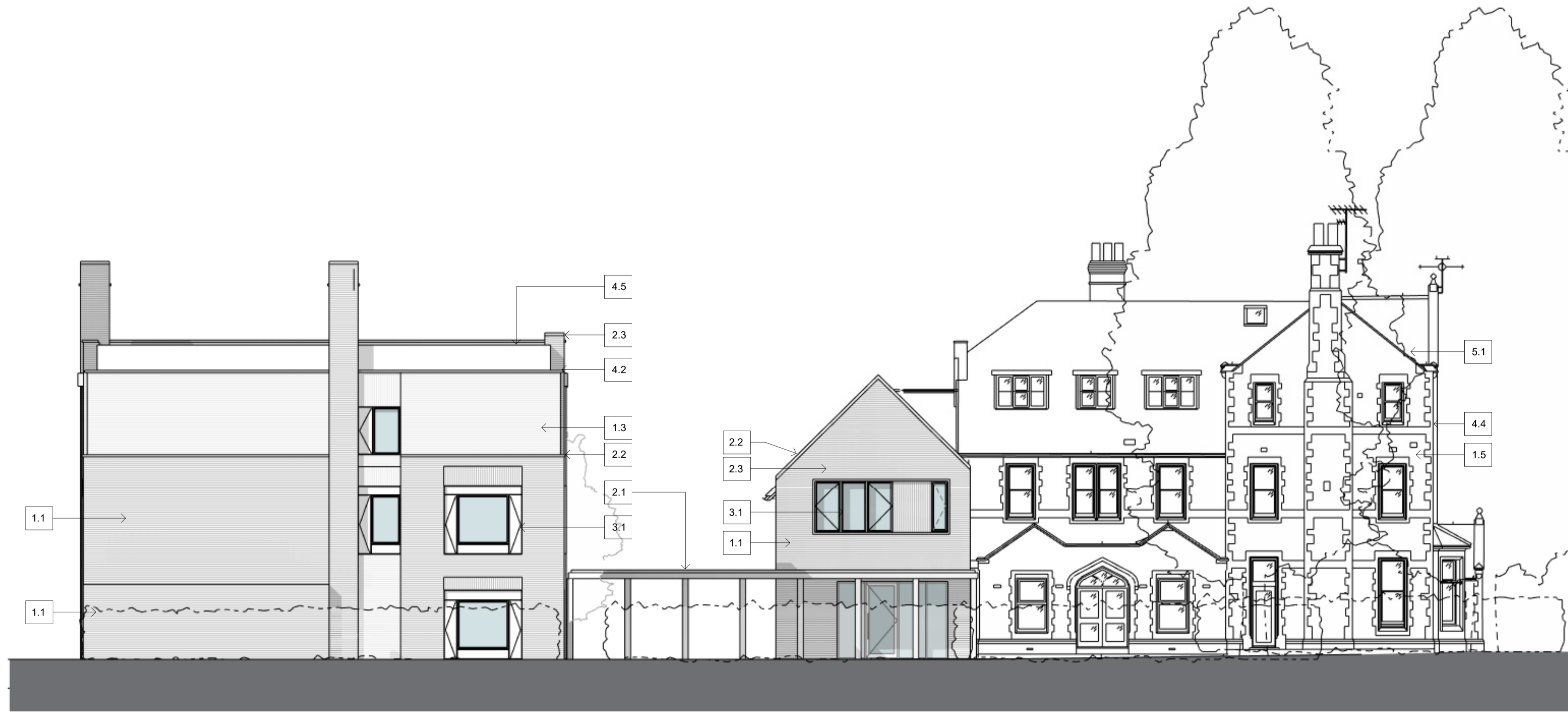
1 West Elevation 1 : 100