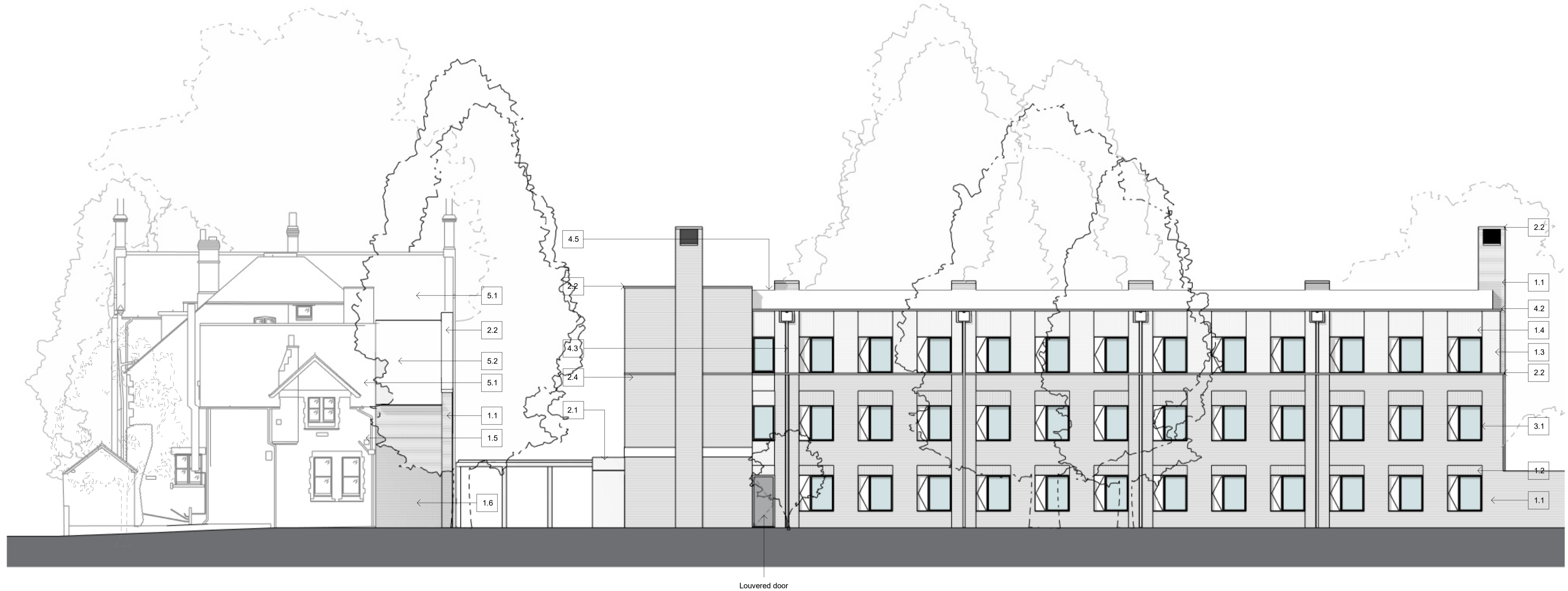
1 North Elevation 1 : 100