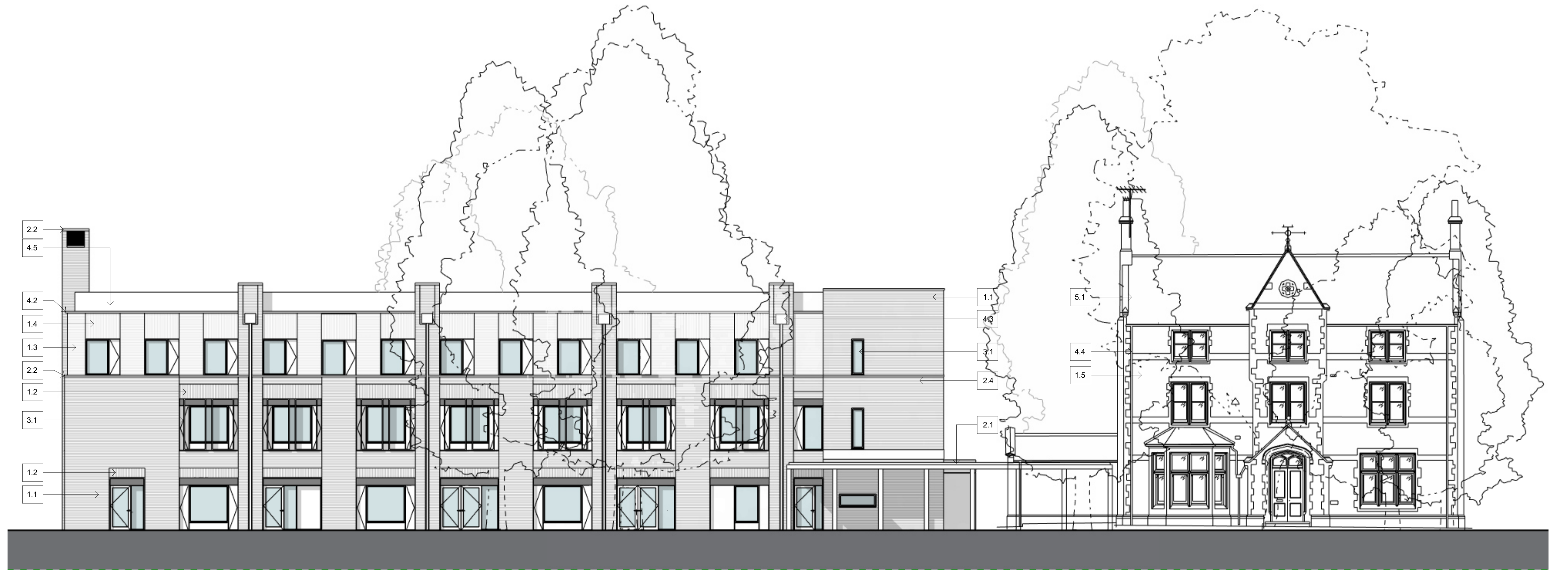
1 South Elevation 2101 1 : 100