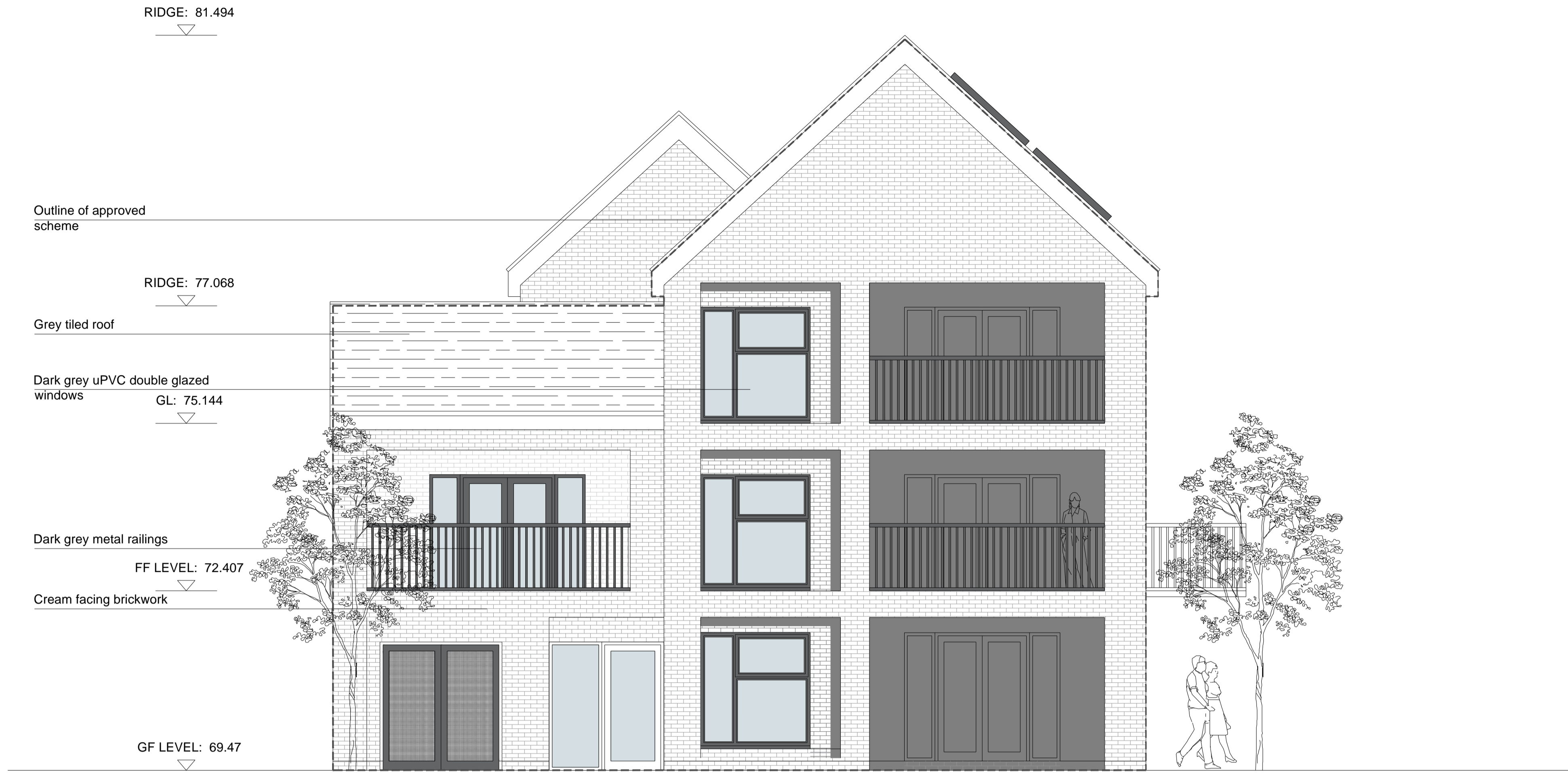
ELEVATION A PROPOSED FRONT ELEVATION (WEST)

Written dimensions to be taken in preference to scaled dimensions.