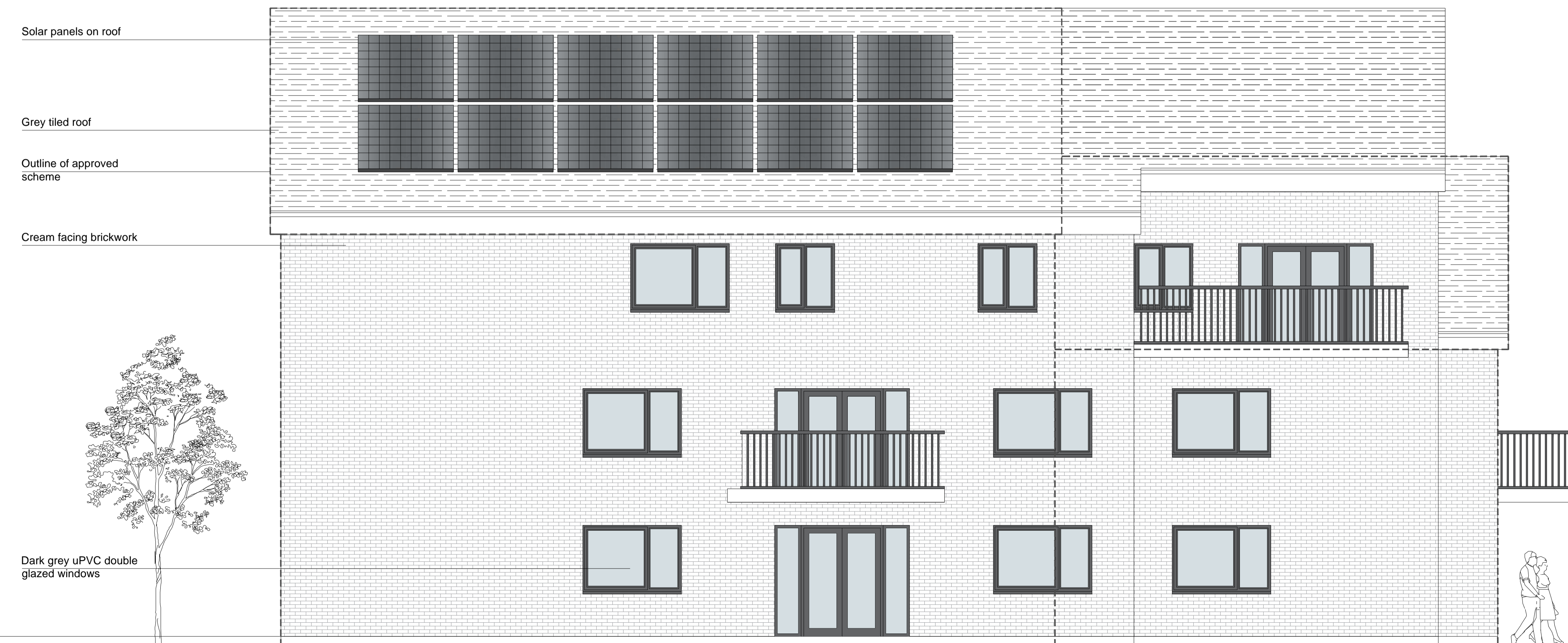
ELEVATION B PROPOSED SIDE ELEVATION (NORTH)